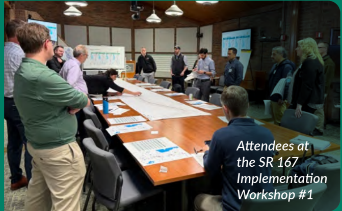
Attendees at the SR 167 Implementation Workshop #1

In the 2025 legislative session, our program received funding to develop the SR 167 Implementation Plan, the next big step following adoption of the Master Plan in 2023. This effort is bringing partners together to identify a package(s) of projects from the Master Plan, outline their funding needs, and prepare recommendations for the Legislature's consideration as we take the first steps towards delivery. We owe the Legislature a final report in December 2026, in advance of the 2027 legislative session, which will conclude the Implementation Plan process. Between now and then, we are hosting a series of workshops that launched in November with partner agency staff and SR 167 Equity Advisory Committee members.