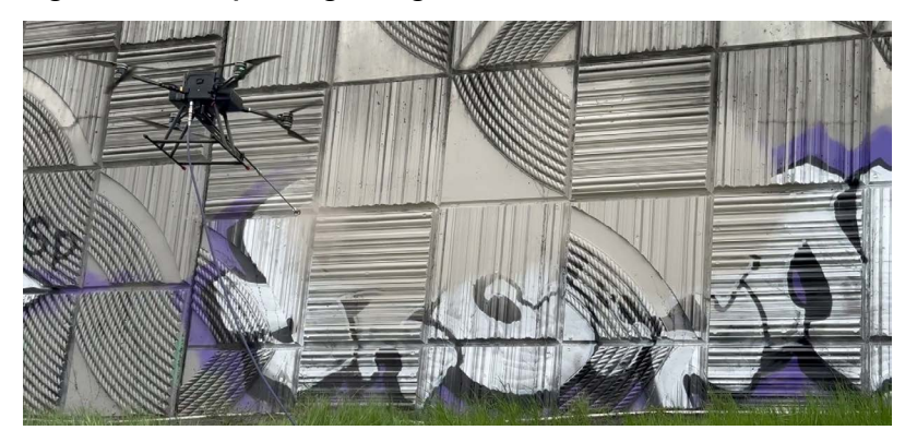
Figure 9. Drone painting over graffiti