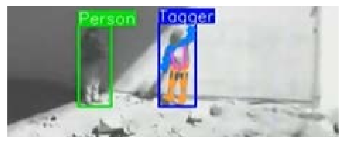
Figure 8c. AlWaysion confidence score