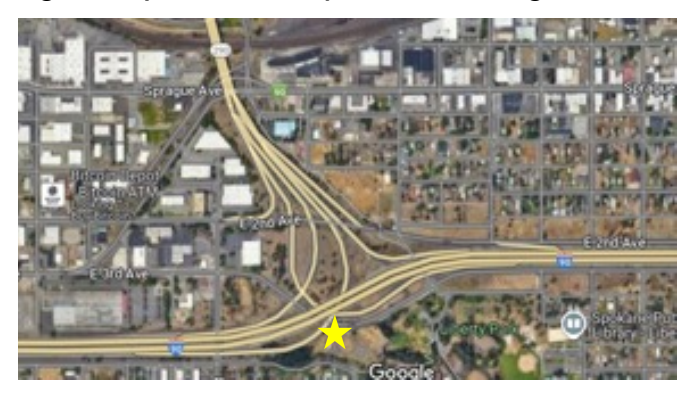
Figure 1. Spokane's AlWaysion and Omnisight installation location & tagger watch area