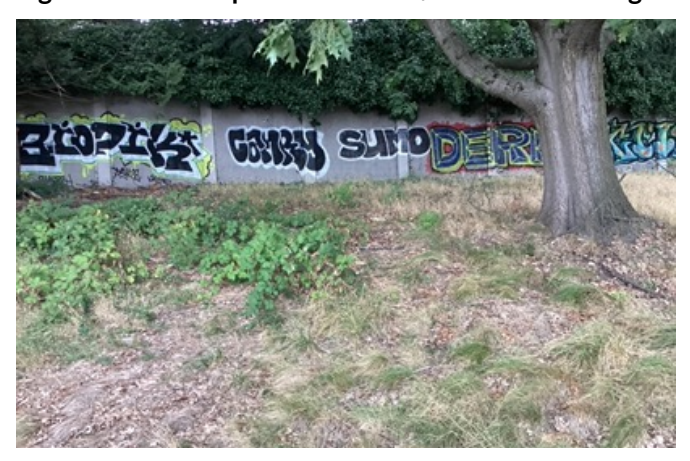
Figure 10. I-5 milepost 170 before/after traditional graffiti removal