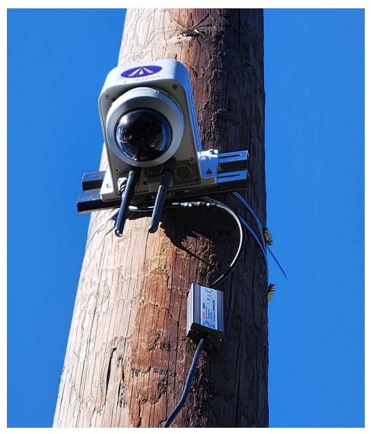
Figure 8a. AlWaysion device installed