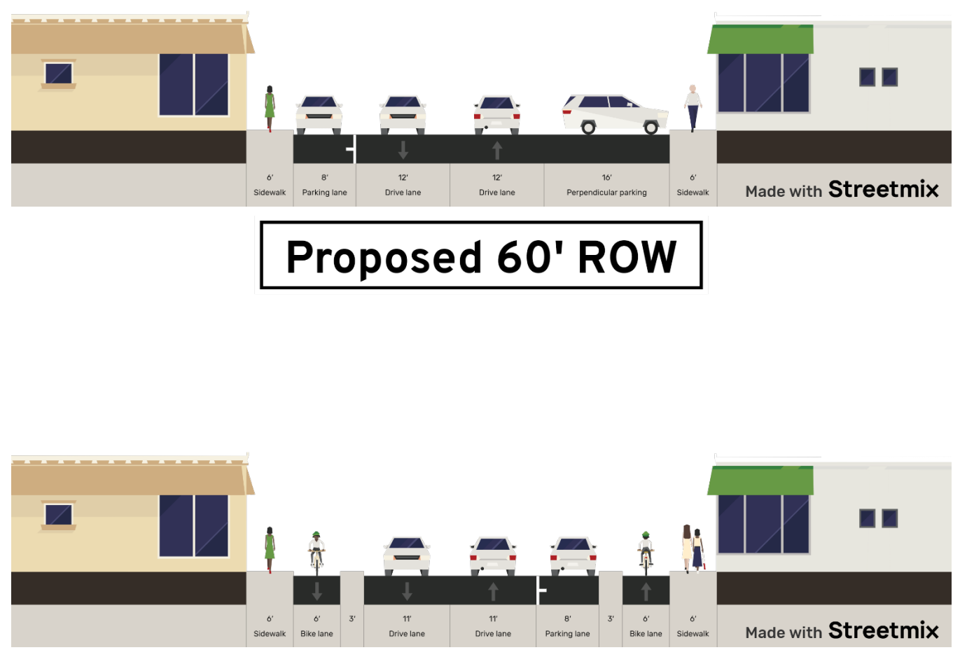
Cross Sections shall include