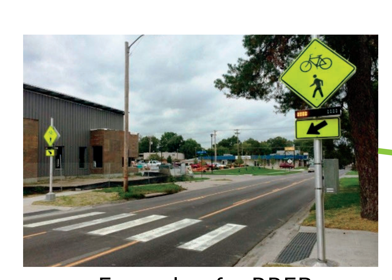
Example of a RRFB