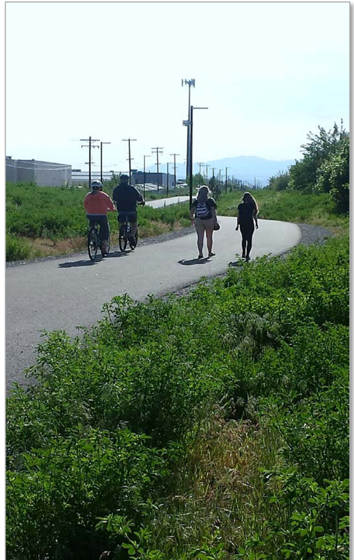
Appleway Trail – City of Spokane Valley