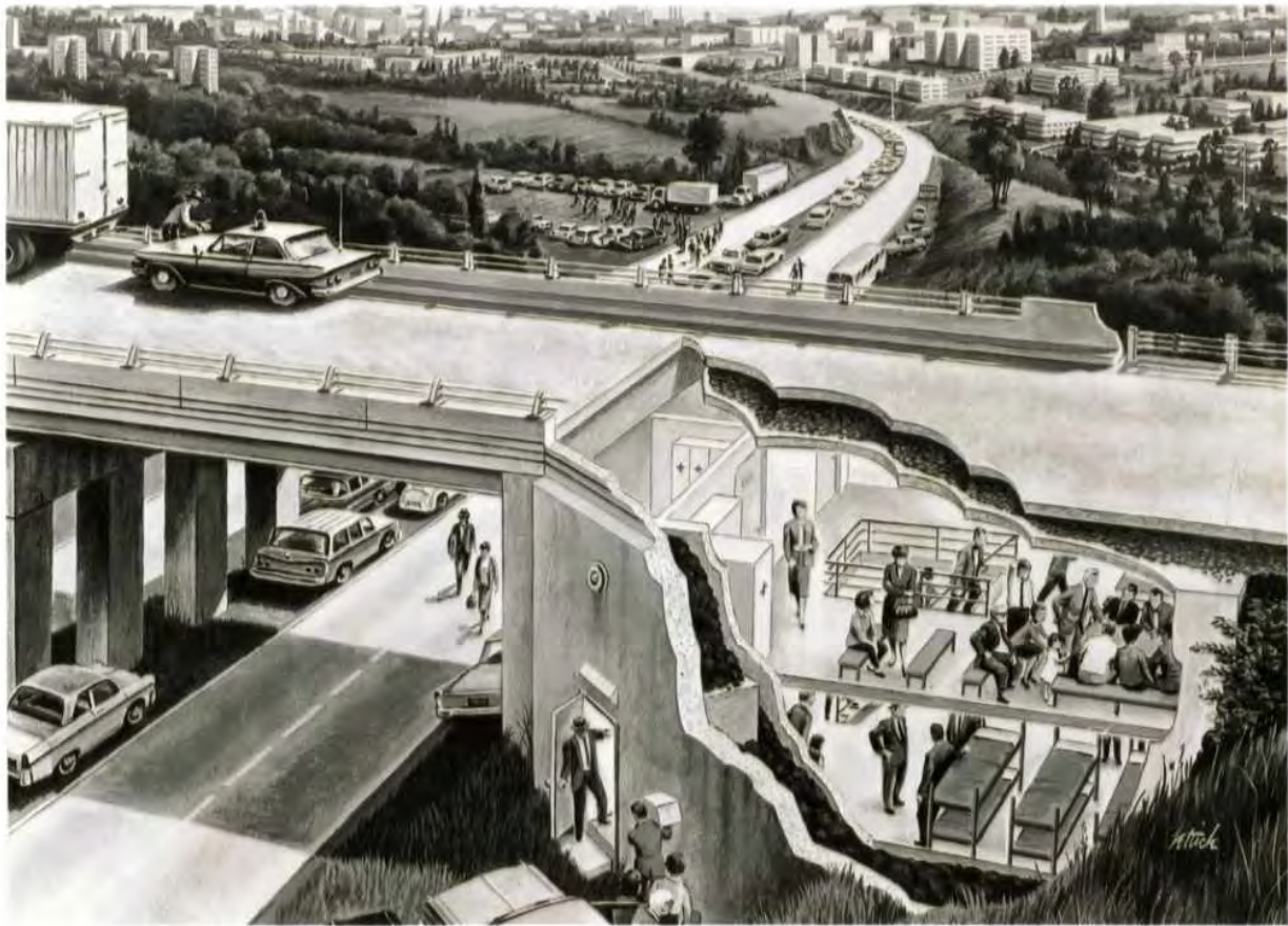
Fig. 1: A prototype highway shelter as envisioned by federal Civil Defense officials.

do against the less fortunate, home owners against renters and apartment dwellers. Basic family shelters could cost $2,500 when median family income was only $5,315 in 1961. v