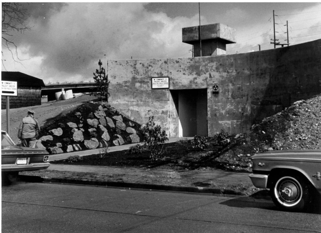
Fig. 4: Shelter façade as seen from Weedin Place, Seattle, on the day of its dedication, March 29, 1963.