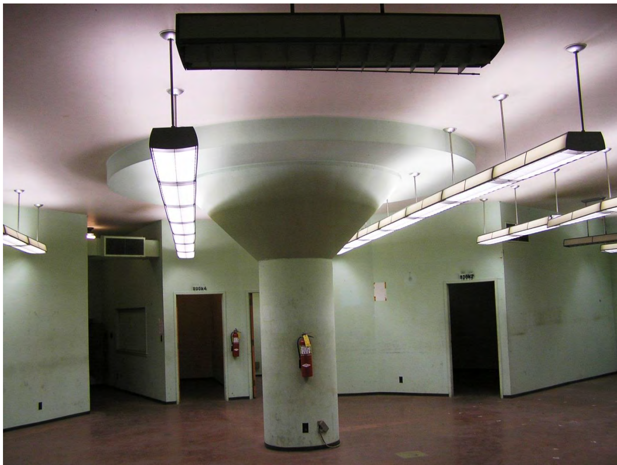
Fig. 5: Fallout shelter main living space, with (left to right) hallway leading to escape tunnel, food distribution room, emergency medical center, and office. Central pillar is in foreground. Photo by Craig Holstine, 2011.

According to the shelter's "Utilization Plan," "assignment of specific segments of the population to this shelter is not possible and occupation of available shelter spaces will necessarily be transient. . . . Since no specific segment of the population has been assigned to this facility, entry will not be denied to anyone until such time as the maximum occupancy has been reached." Shelter occupants would be permitted to bring in only items that "would increase shelter habitability," as well as medicines and "special health foods." "General purpose items will be turned into general supply for possible later re-issue for the good of all. Animals and pets will not be permitted into the shelter for obvious health reasons." "When the maximum occupancy of the shelter has been reached, . . . the manager will cause the doors to be closed and locked. Any persons remaining outside the shelter will be directed to proceed to the next nearest public shelter." No other public shelter is known to have existed in the vicinity, however. xvii