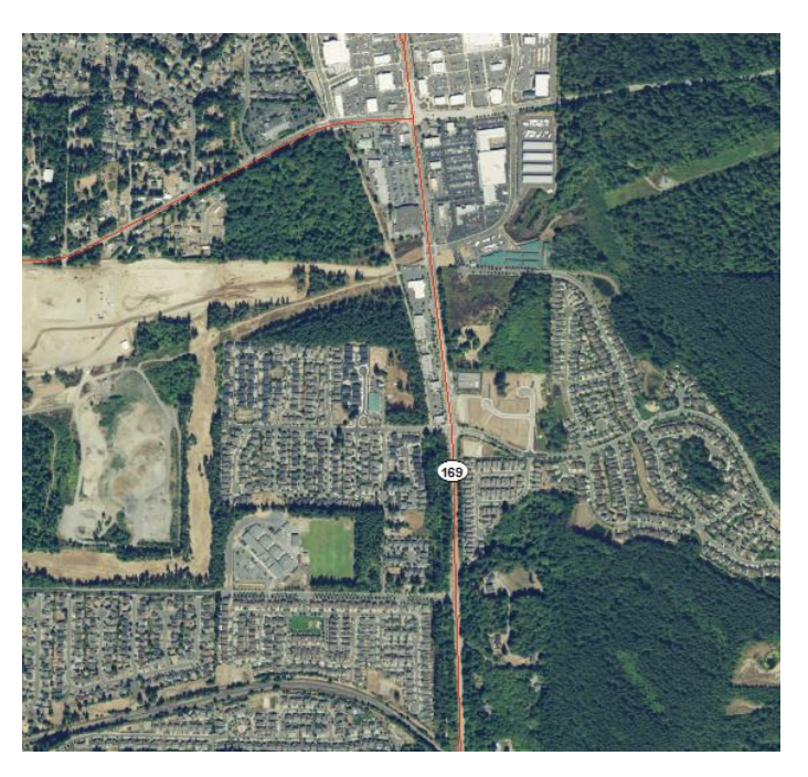
Suburban Development in Maple Valley