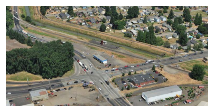
SR 432/SR 433 intersection