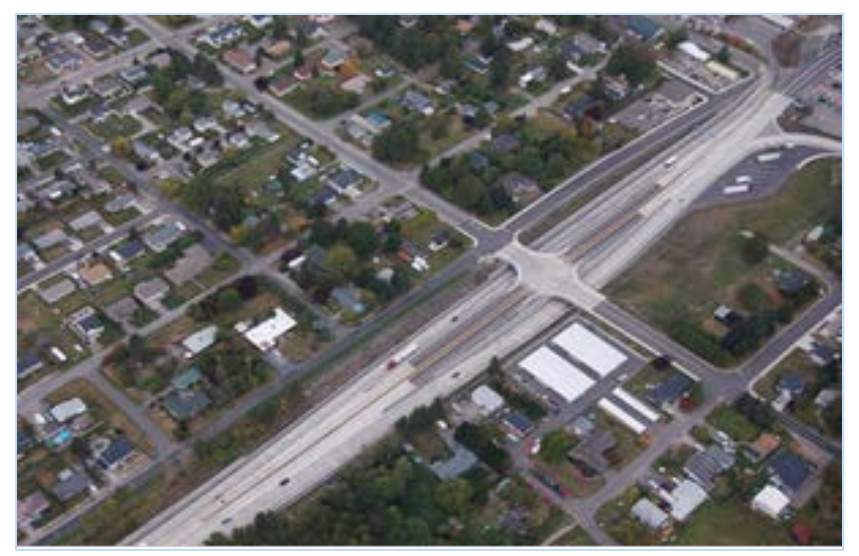
Lane configuration SR 543/ D Street Intersection approaching border