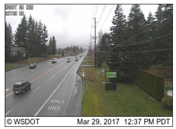
A transit stop on SR 539 with a bus pullout.