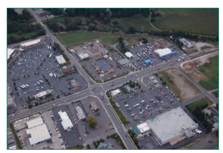
SR 539 at Kok Road where segment narrows to two lanes.

• Evaluate options for addressing slowdowns and nonmotorized access through Lynden.