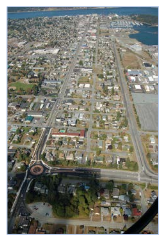
The SR 20 Spur/Commercial Avenue (left) in Anacortes looking north.