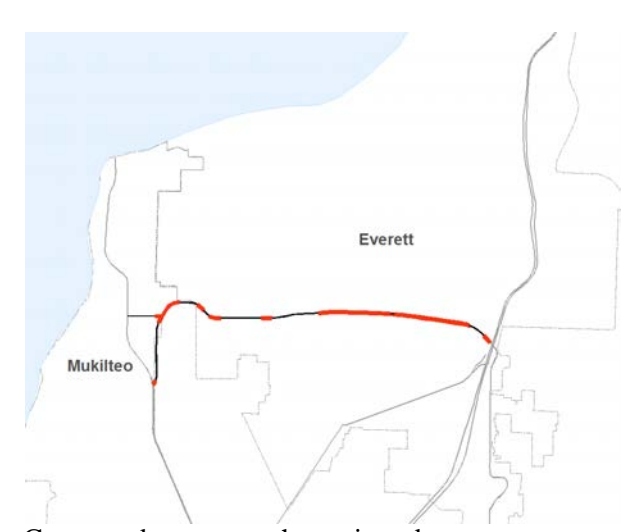
Congested segments shown in red