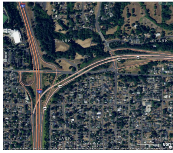
The SR 500 interchange with I-5