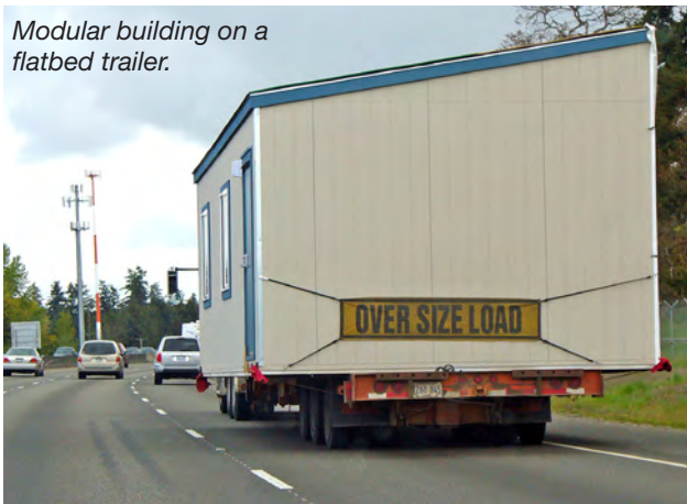
Modular building on a flatbed trailer.