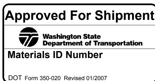
Figure 9-6 Tag

All documentation associated with the tag in Figure 9-6 will be reviewed and approved by the WSDOT Materials Fabrication Inspection Office and kept at the WSDOT Materials Fabrication Inspection Office and kept at the point of manufacture.