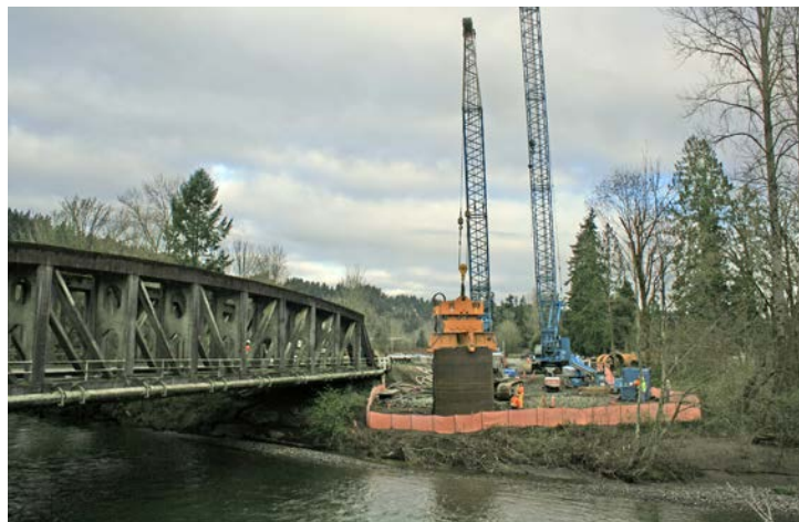
Contractor crews working for WSDOT in the process of rebuilding a new bridge on State Route 162 across the Puyallup River Bridge in Pierce County.

If a state does not meet the minimum condition for three consecutive years, a funding penalty will apply during the following fiscal year and each year thereafter until it is in compliance. The state must obligate and set aside an amount to 50 percent of the apportionment for the Highway Bridge Program in fiscal year 2009, from the NHPP apportionment, only for projects on NHS bridges.