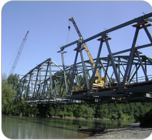
Nooksack River Bridge