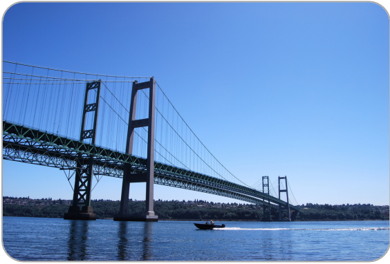
Tacoma Narrows Bridge