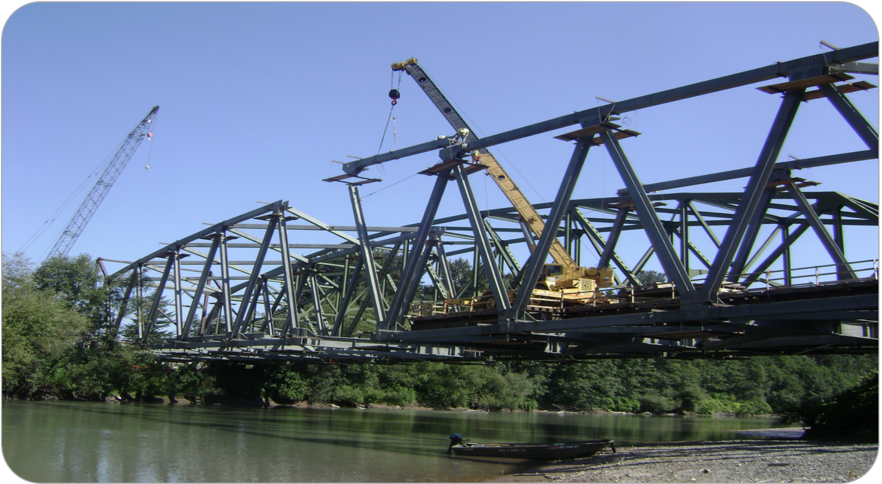
Nooksack River Bridge