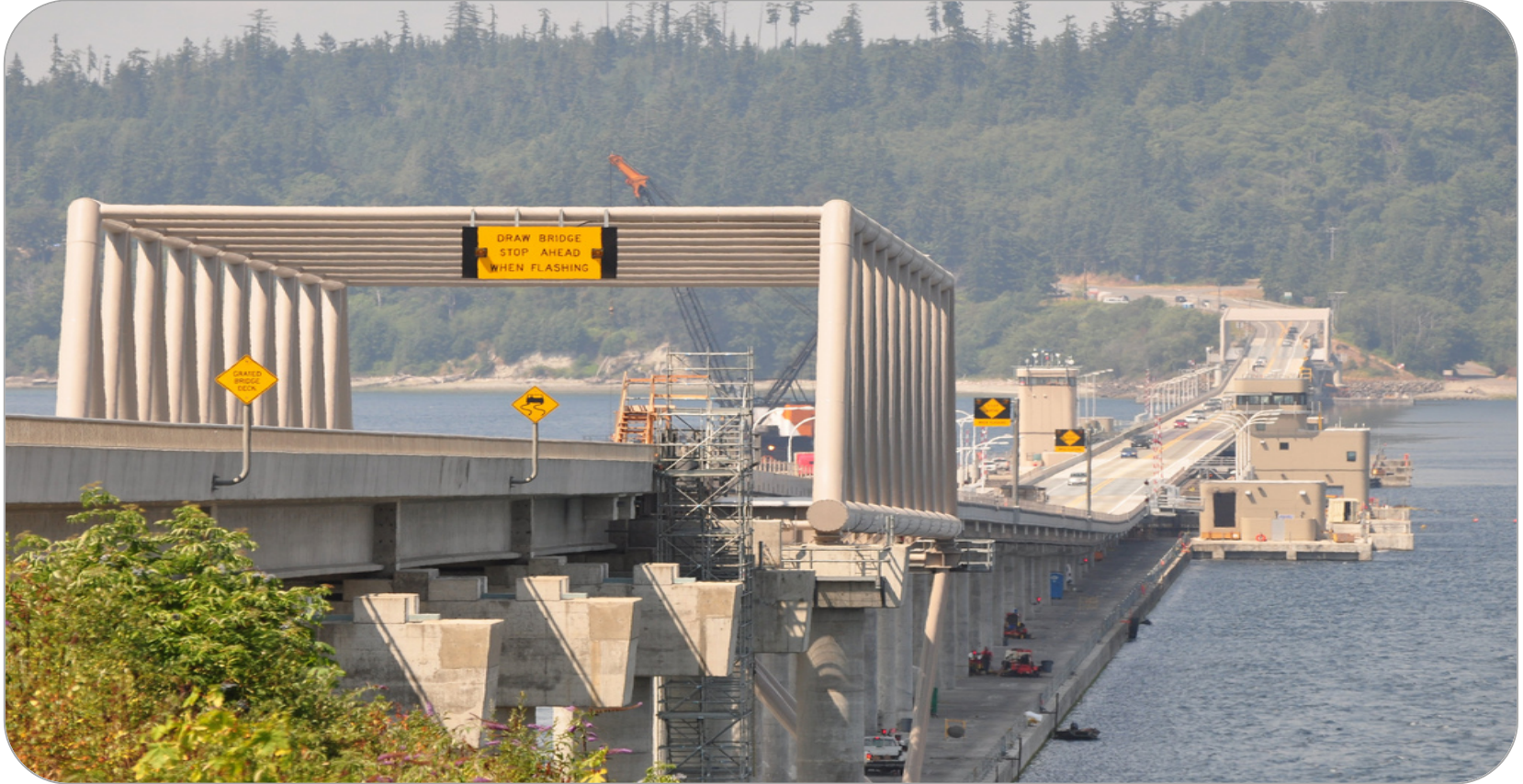
East Half Hood Canal Bridge Replacement