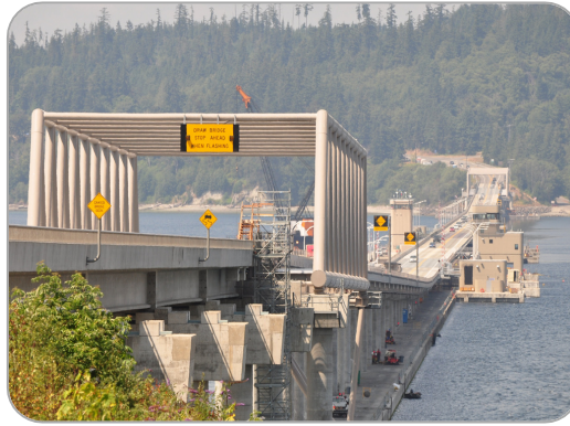
Hood Canal Bridge