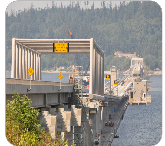
East Half Hood Canal Bridge Replacement