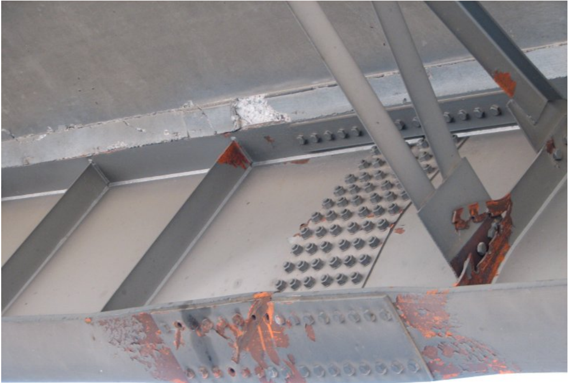
VAL VISTA BLVD UNDERPASS