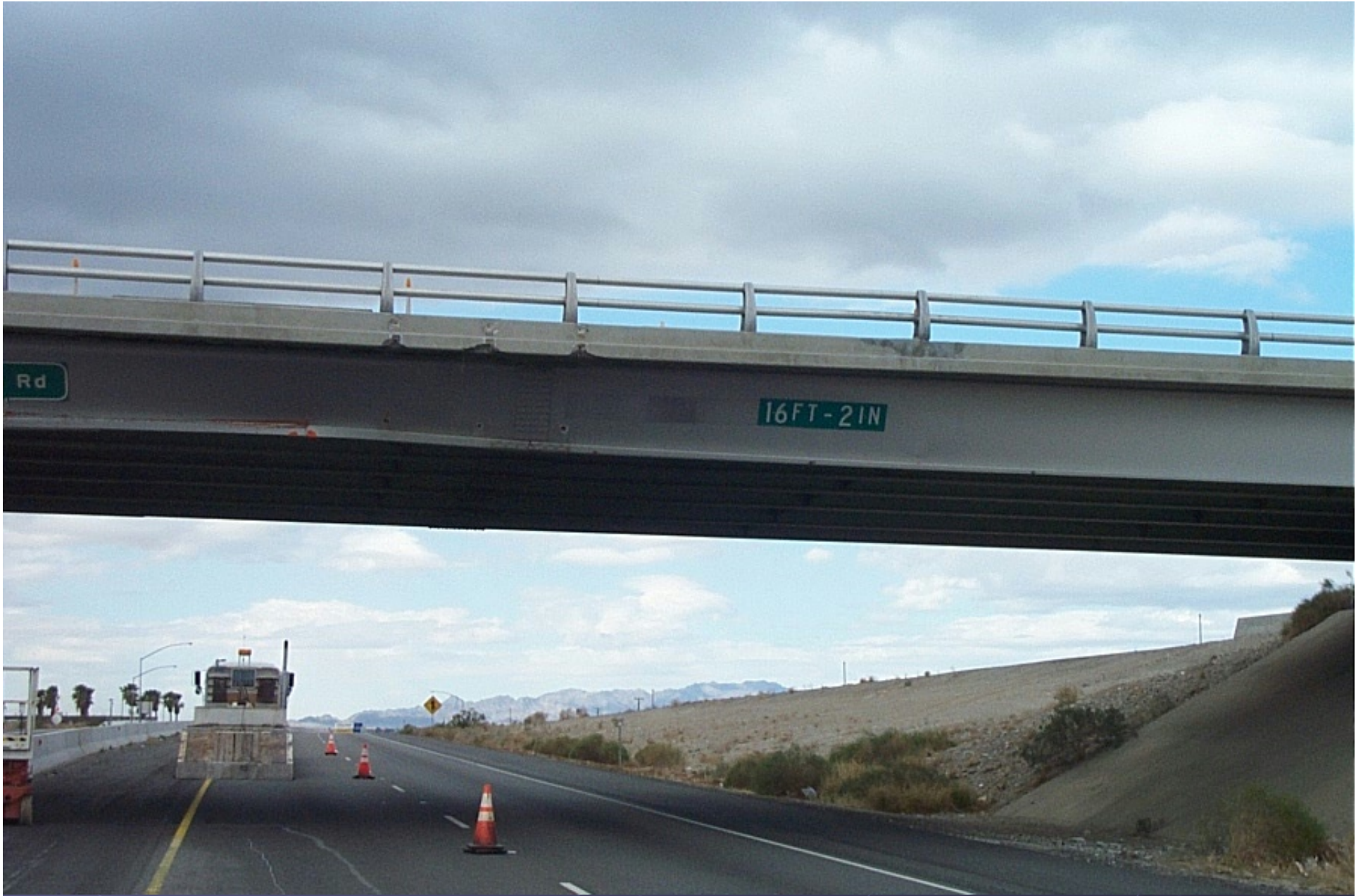
POSTON RD. TI. UNDERPASS