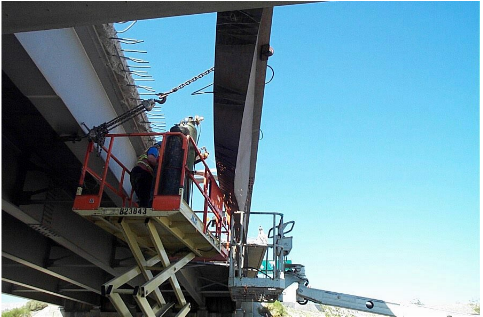
POSTON RD. TI. UNDERPASS