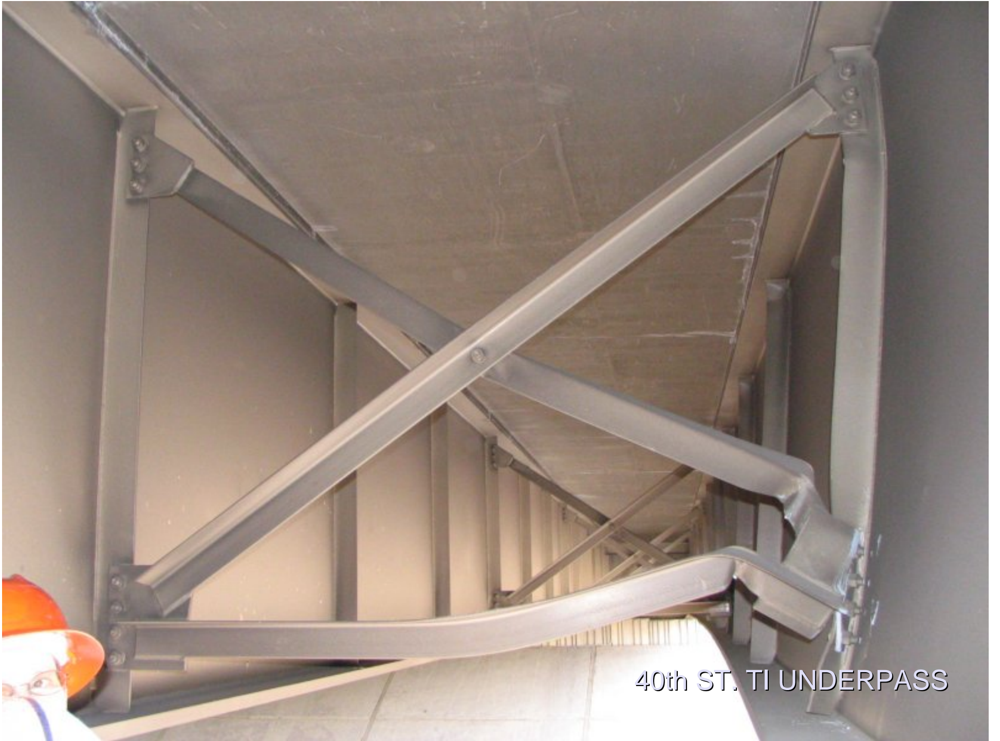
40th ST. TI UNDERPASS