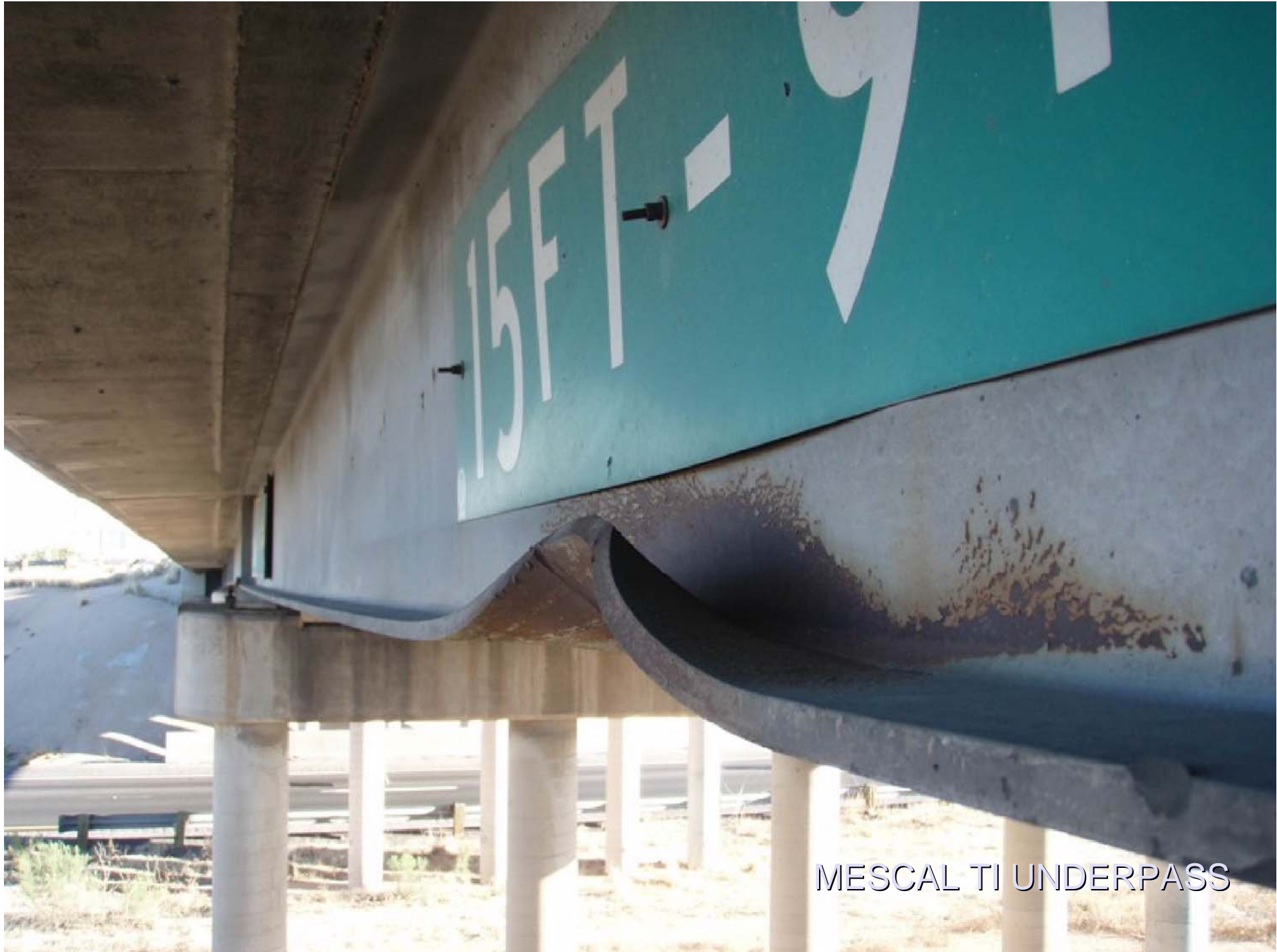
MESCAL TI UNDERPASS