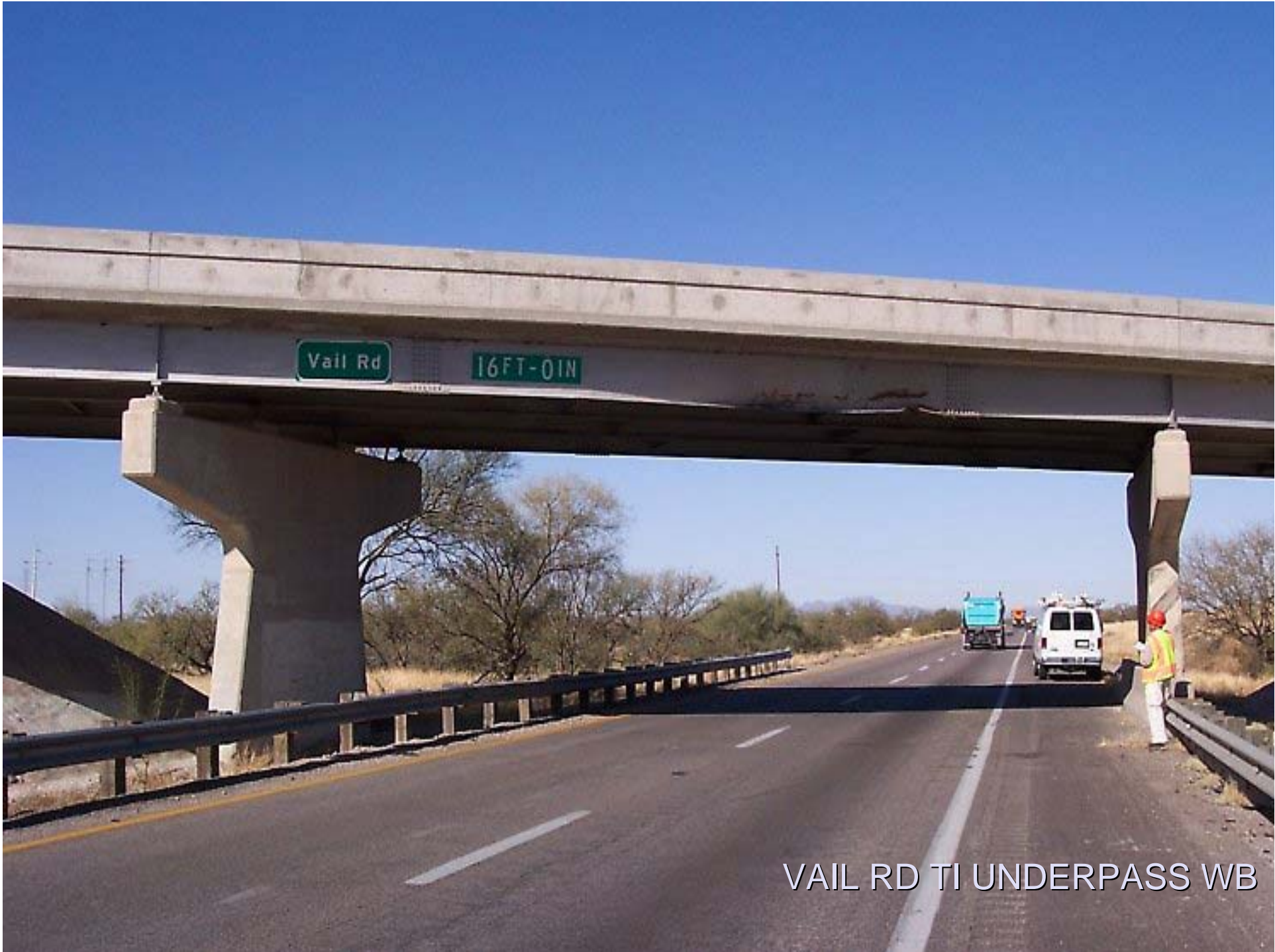
VAIL RD TI UNDERPASS WB