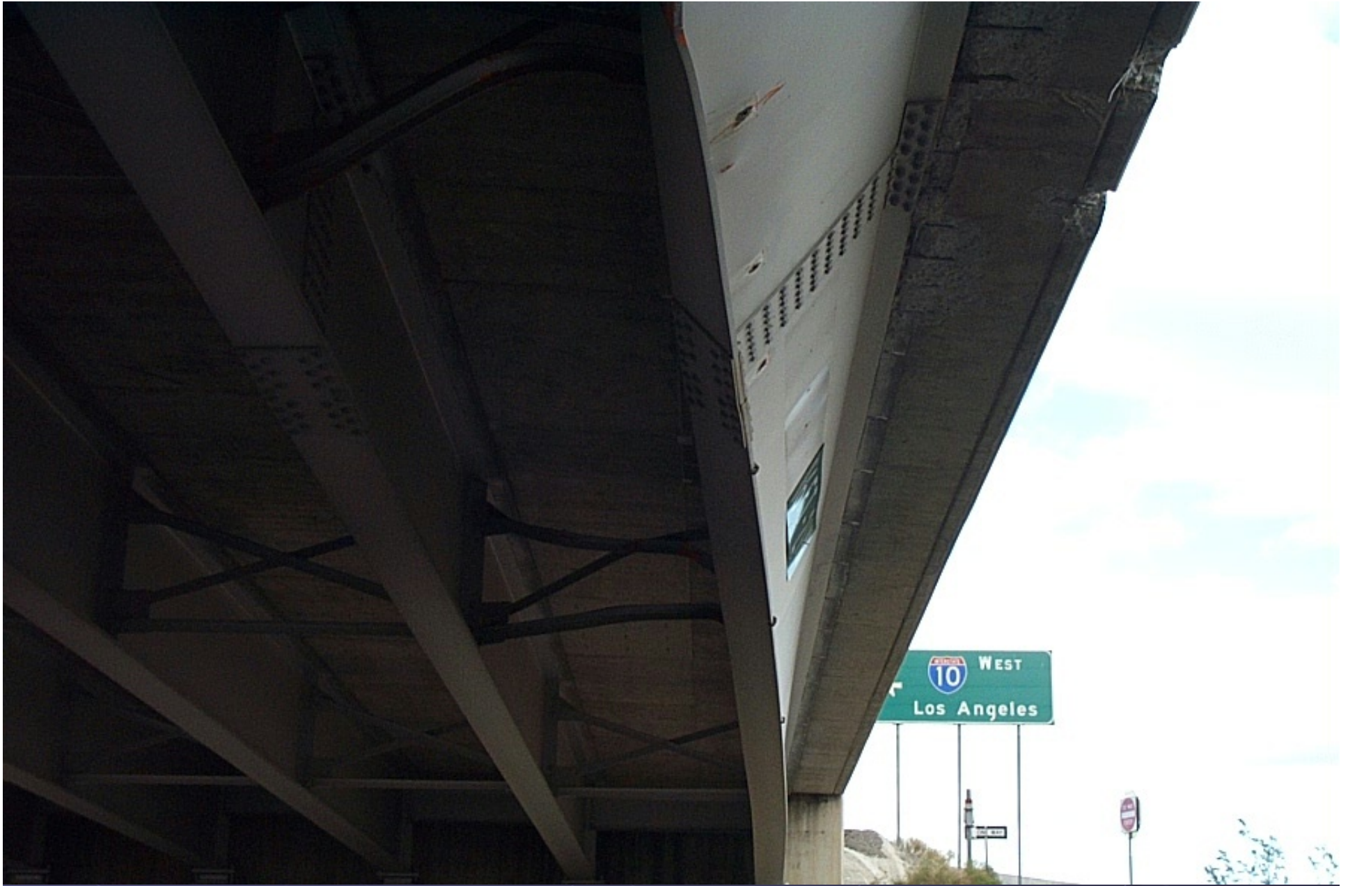
POSTON RD. TI. UNDERPASS