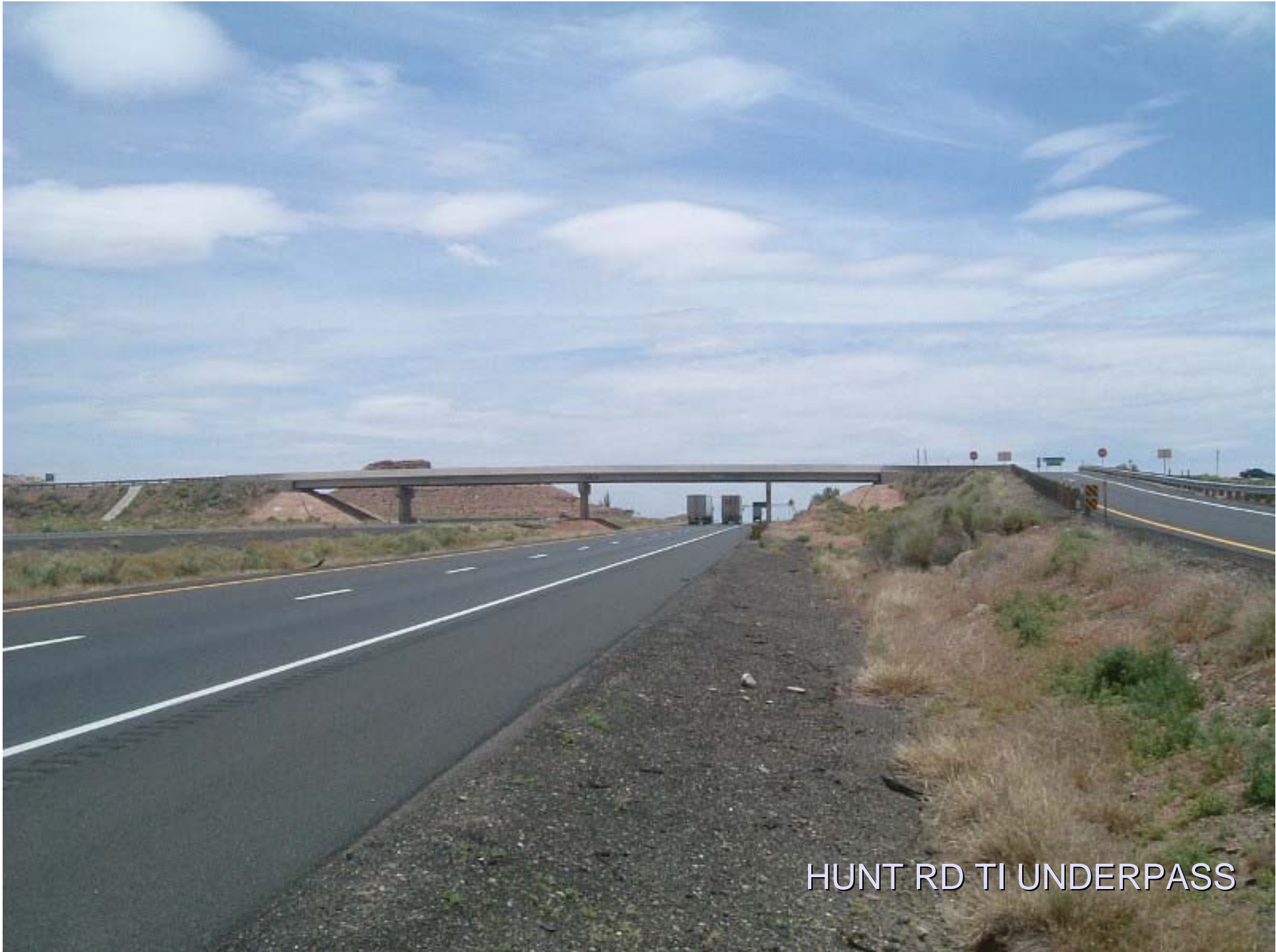
HUNT RD TI UNDERPASS