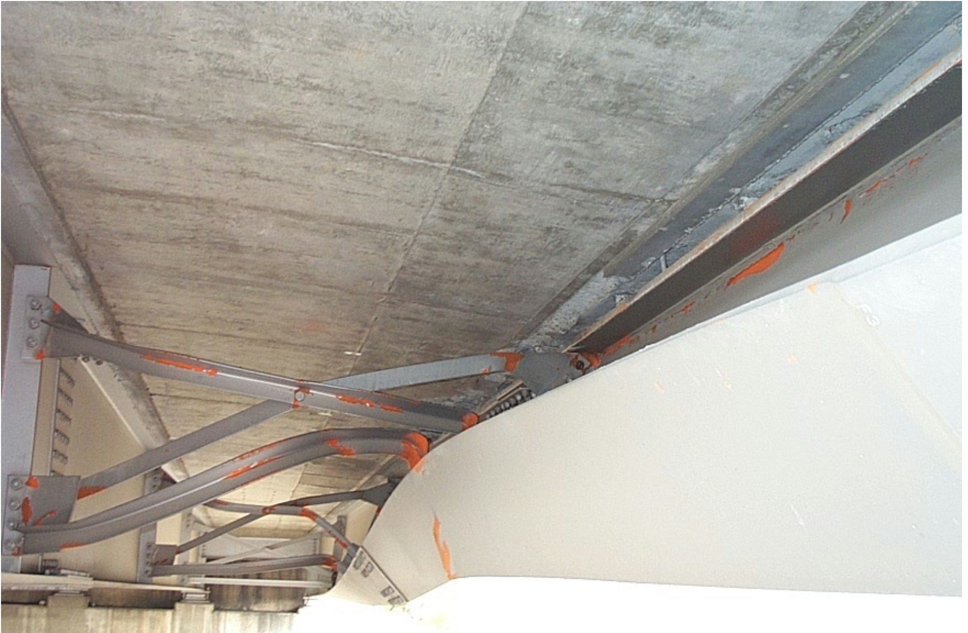
POSTON RD. TI. UNDERPASS