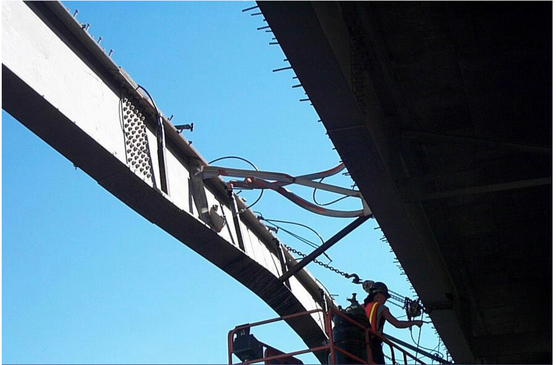
POSTON RD. TI. UNDERPASS