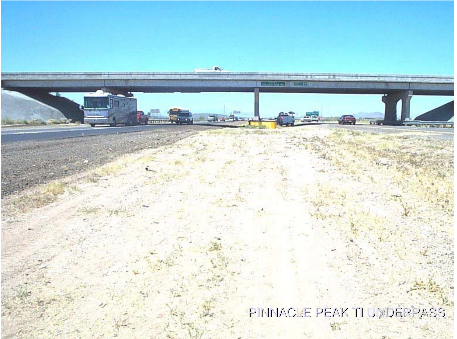
PINNACLE PEAK TI UNDERPASS