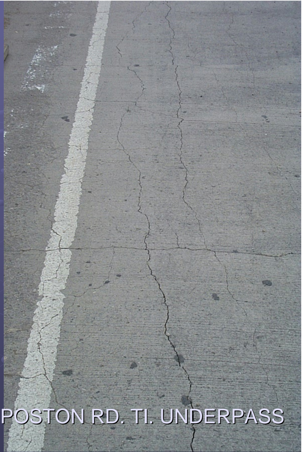
POSTON RD. TI. UNDERPASS