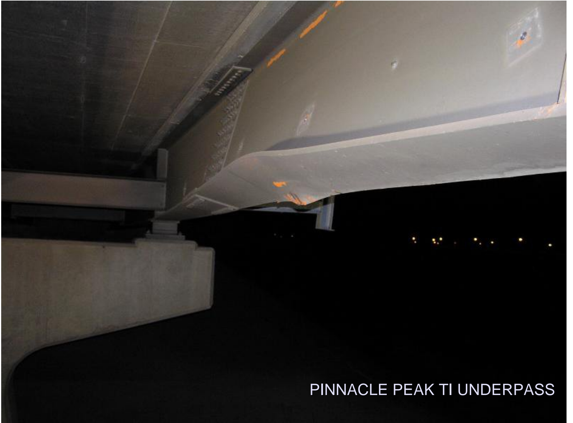
PINNACLE PEAK TI UNDERPASS