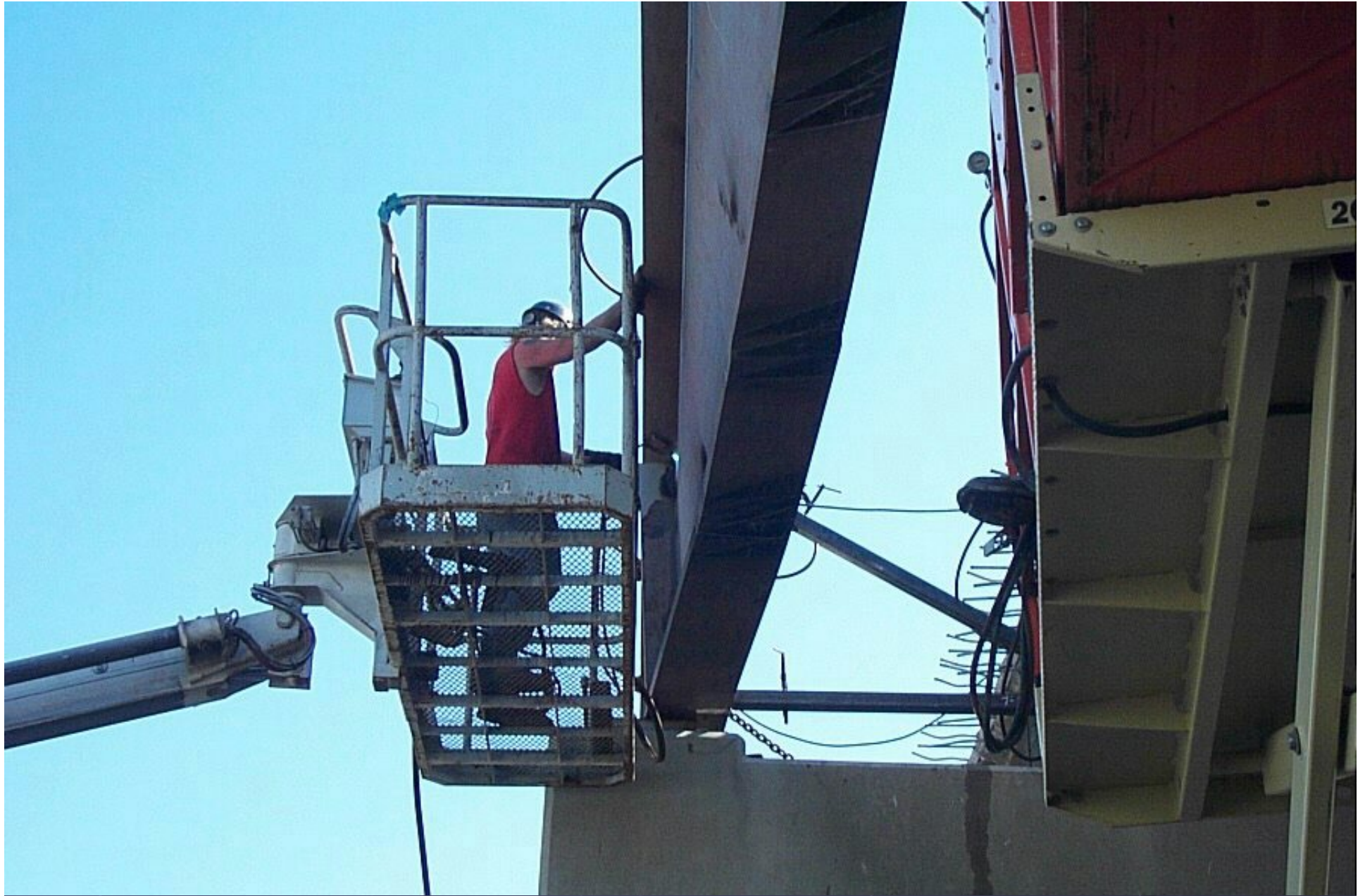
POSTON RD. TI. UNDERPASS