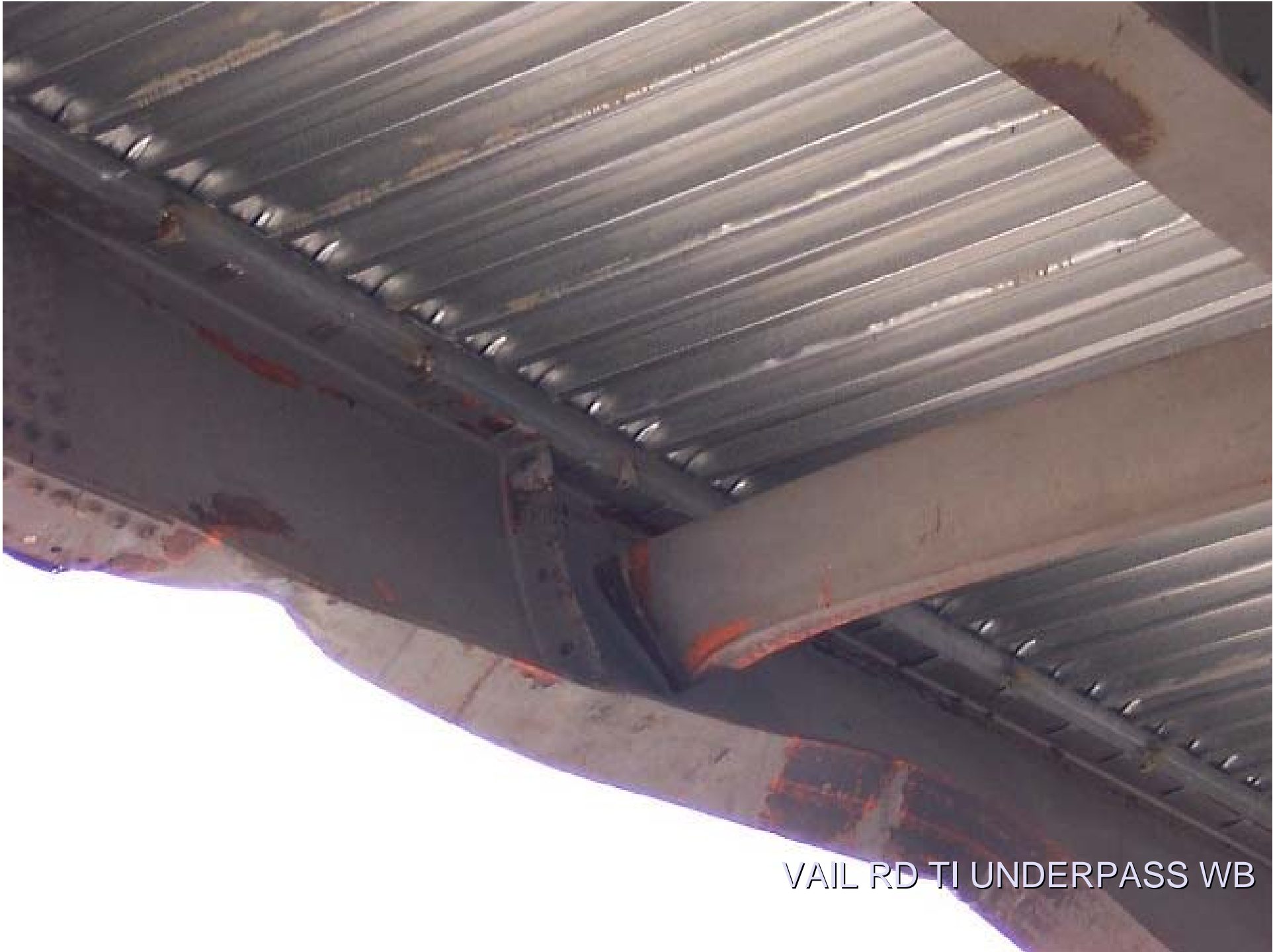
VAIL RD TI UNDERPASS WB