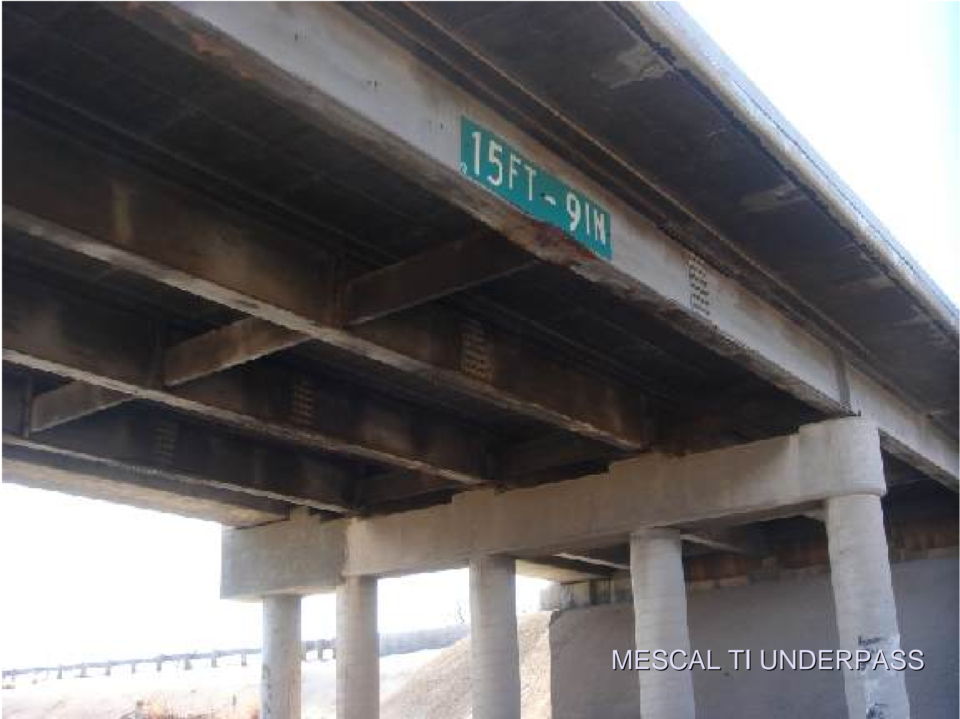
MESCAL TI UNDERPASS