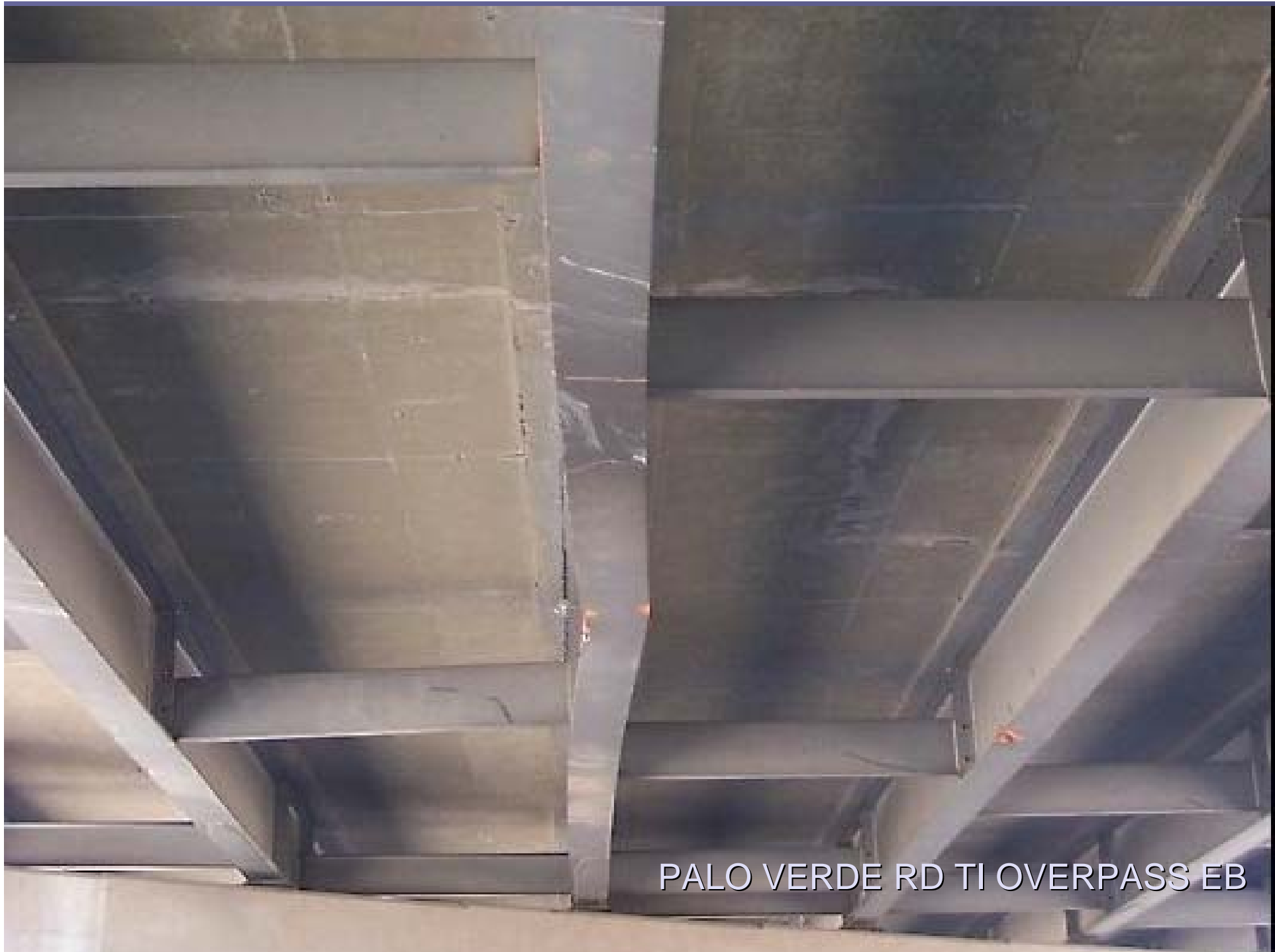
PALO VERDE RD TI OVERPASS EB