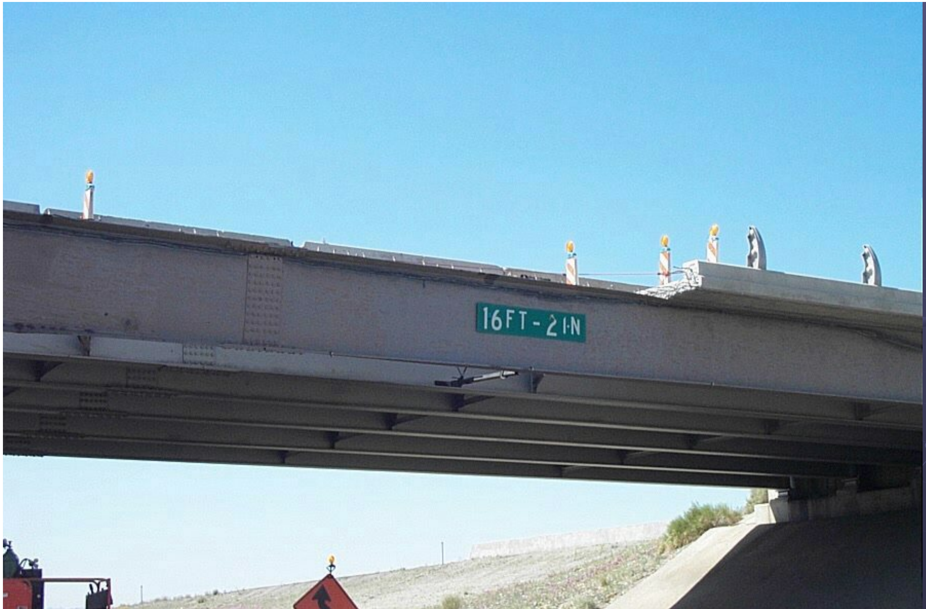
POSTON RD. TI. UNDERPASS