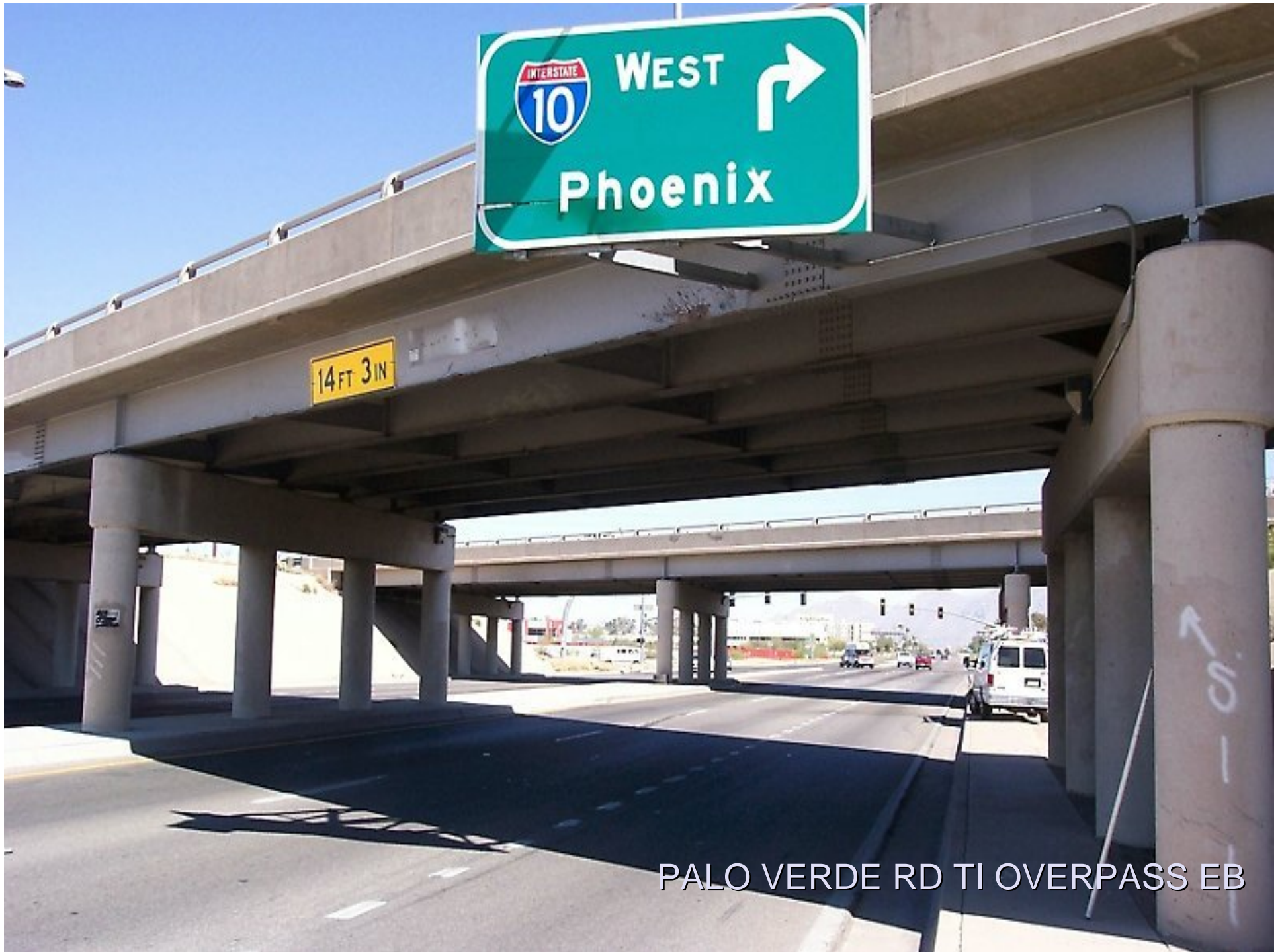
PALO VERDE RD TI OVERPASS EB