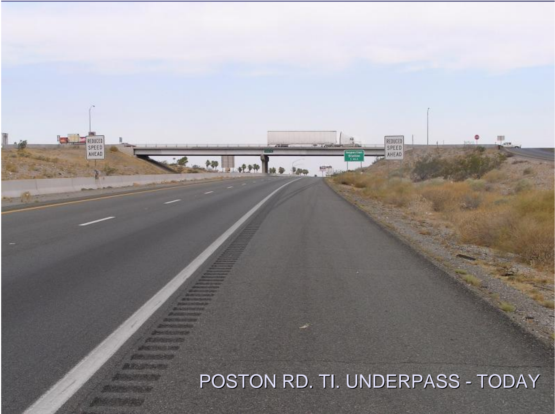
POSTON RD. TI. UNDERPASS - TODAY