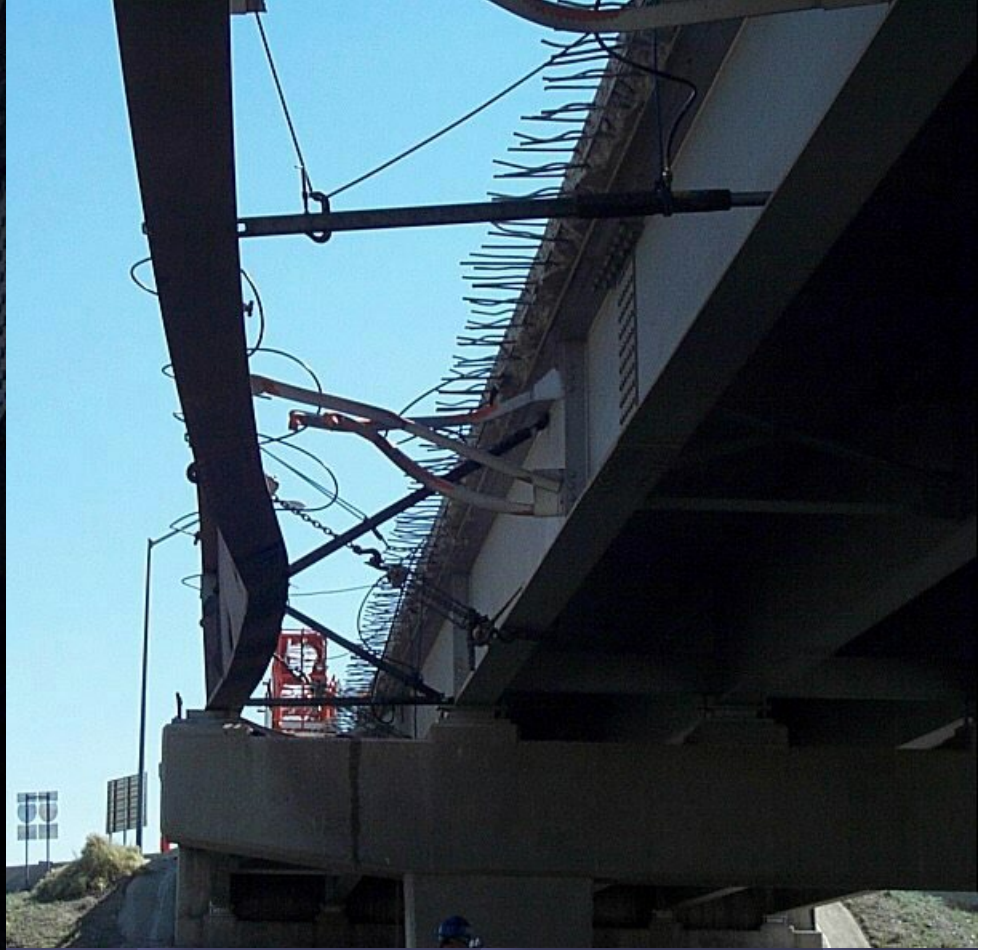
POSTON RD. TI. UNDERPASS