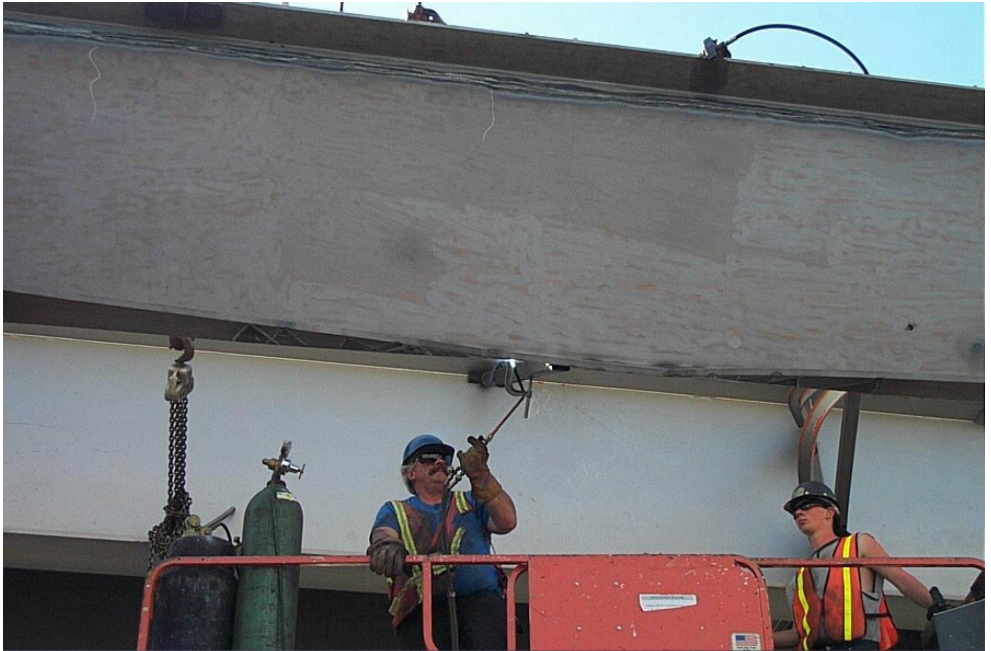
POSTON RD. TI. UNDERPASS