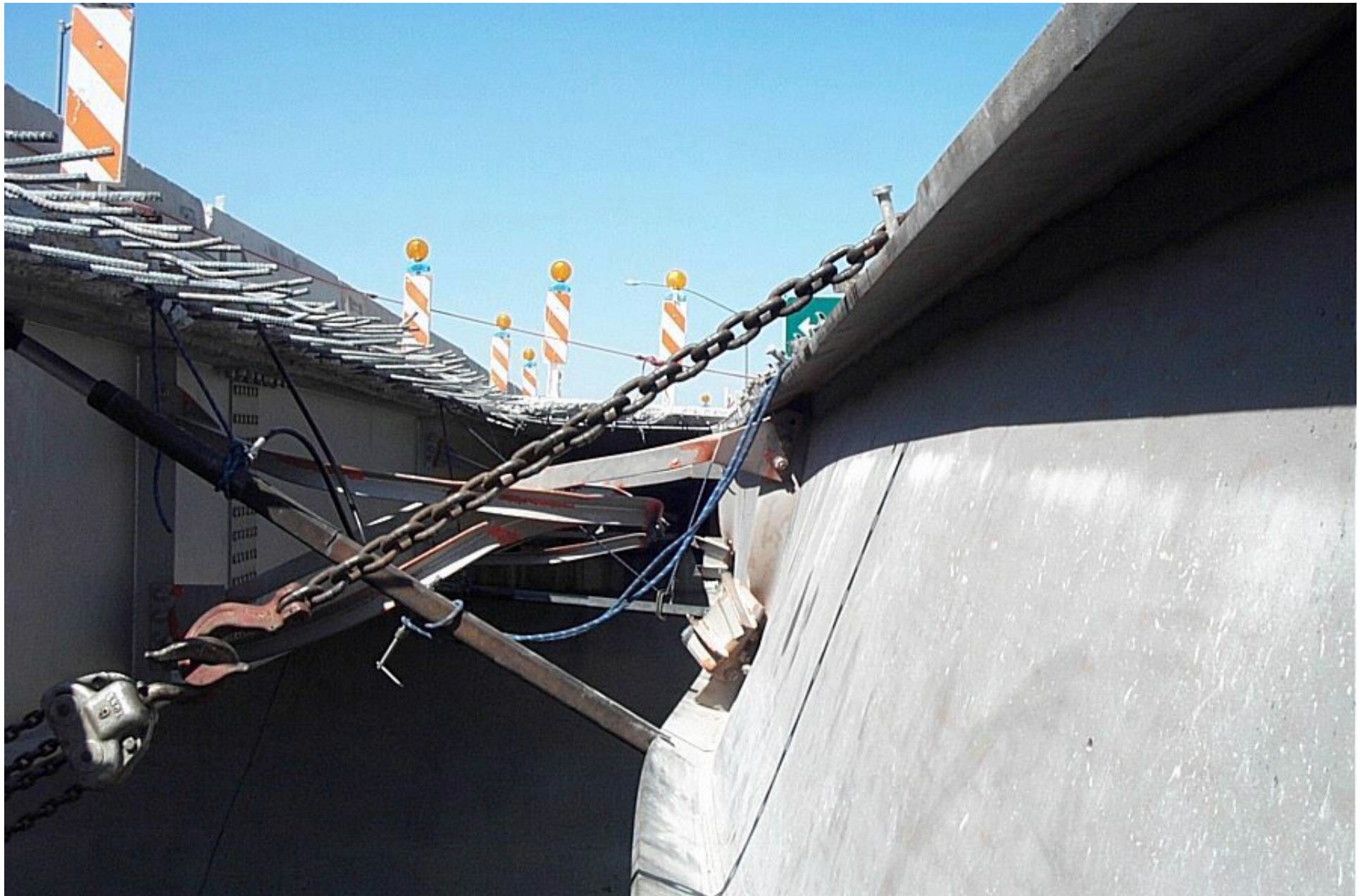
POSTON RD. TI. UNDERPASS