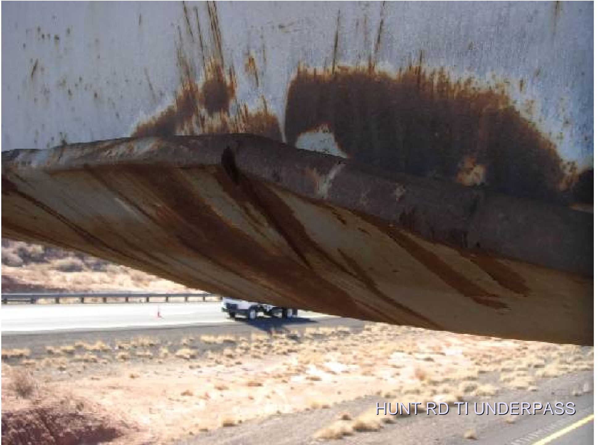
HUNT RD TI UNDERPASS