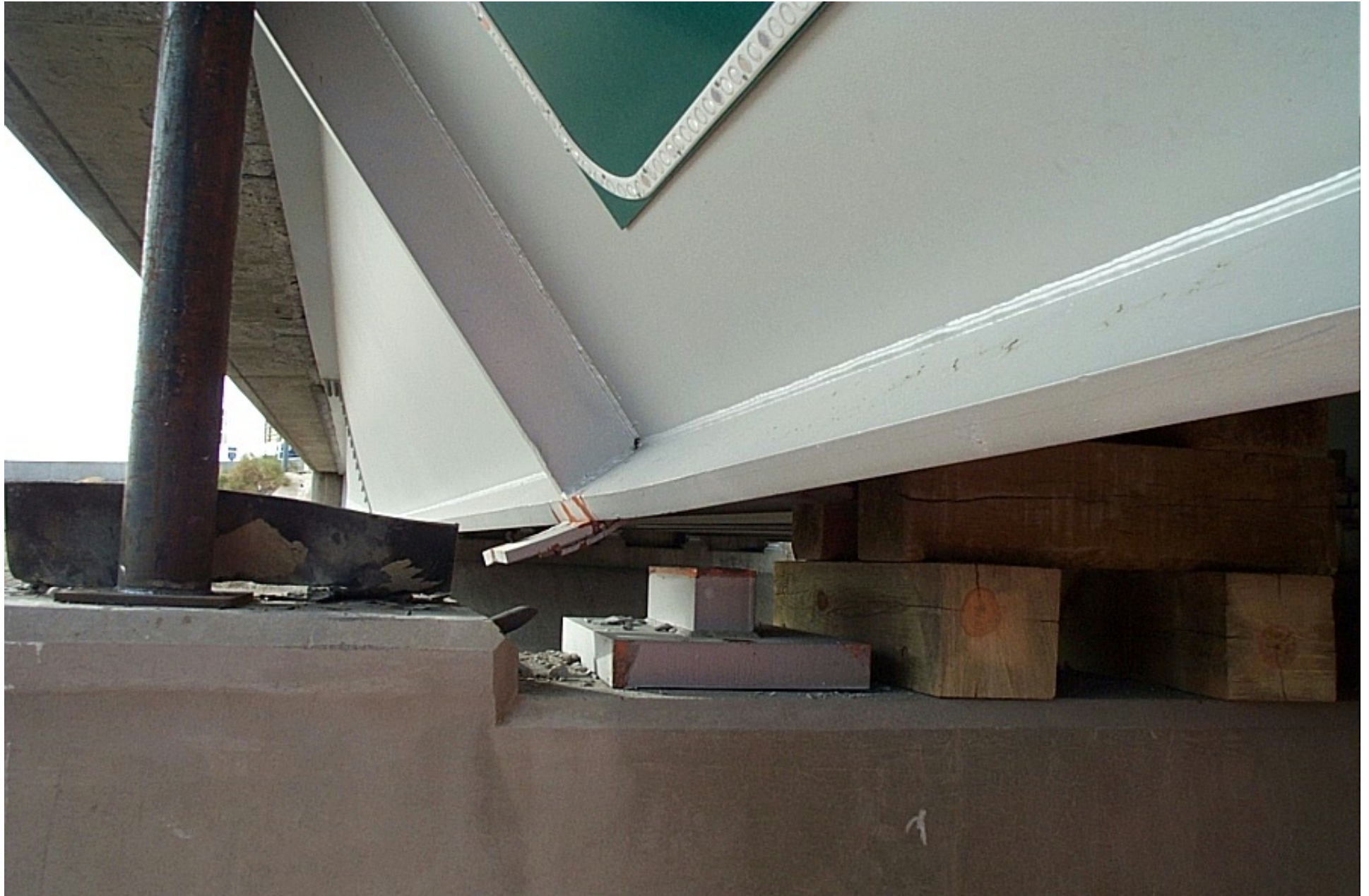
POSTON RD. TI. UNDERPASS