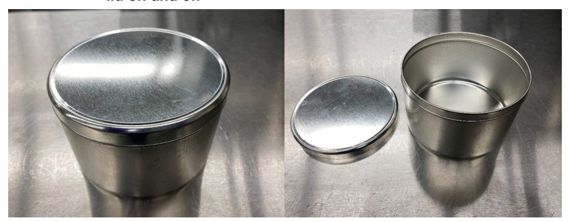
Figure 1 Pictures of acceptable 16 to 24-ounce aluminum container with lid off and on

WSDOT may independently test mix design samples for asbestos containing materials.