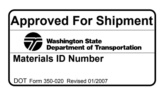
Figure 9-6 Tag

All documentation associated with the tag in Figure 9-6 will be reviewed and approved by the WSDOT Materials Fabrication Inspection Office and kept at the WSDOT Materials Fabrication Inspection Office.