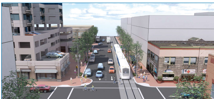
Design concept for light rail in downtown Vancouver.

In downtown Vancouver, trains will travel north on Broadway Street and south on Washington Street in a dedicated lane. Trains will travel east and west on 17th Street to the terminus station near the Marshall/Luepke Center. Four transit stations will be built along the line. In addition, three park and ride facilities are planned to accommodate about 2,900 parking spaces. Park and rides will be built near Fifth and Washington streets, 15th and Washington streets, and across from the Marshall/Luepke Center.