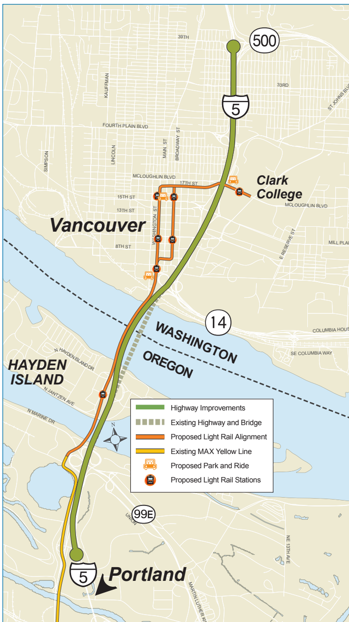
The Columbia River Crossing Project (CRC) is expanding transit options in Vancouver and will improve connections, reliability and travel times for riders.

The Columbia River Crossing project (CRC) is expanding transit options between Portland and Vancouver and will improve connections, reliability and travel times for riders. This bi-state project will extend an existing 52-mile light rail system across the Columbia River to connect the region's largest and most concentrated employment area in downtown Portland with Vancouver.