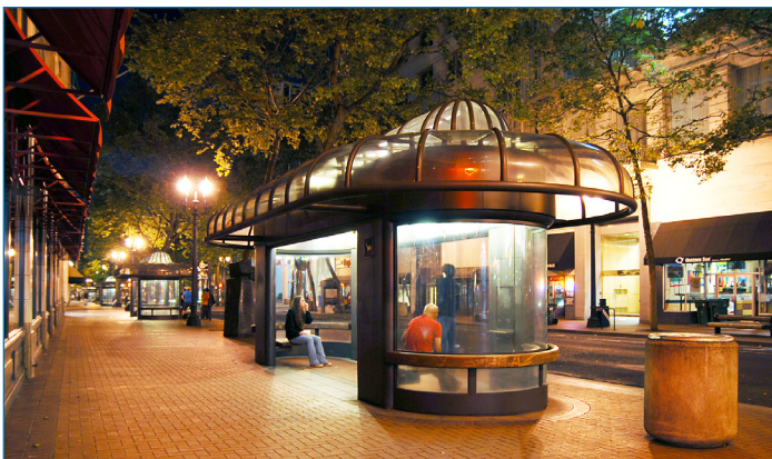
Station lighting increases visibility for those on or approaching platforms.