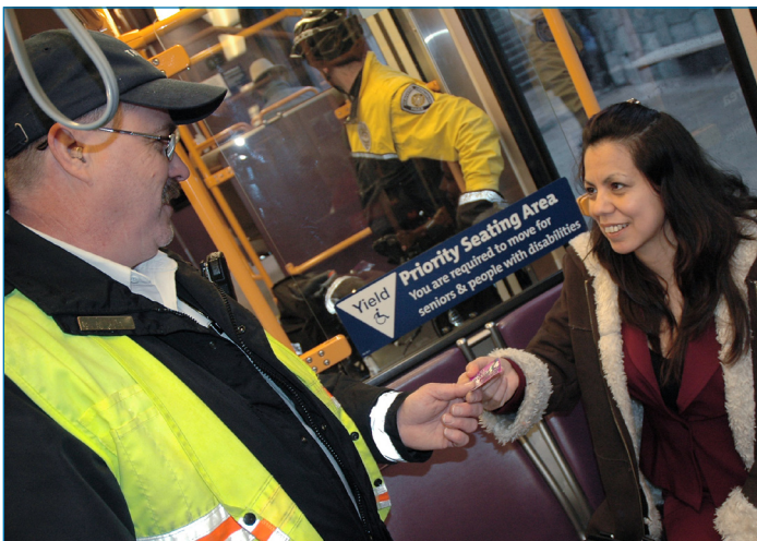
Transit police and fare inspectors help increase passenger safety.