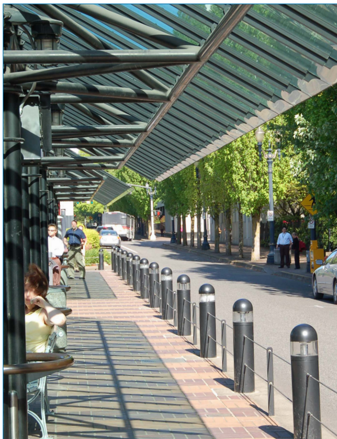
Cable, bollards and distinctive surfaces help define transit, auto and pedestrian areas.

The community and project citizen advisory groups will continue to be consulted as light rail designs are refined to gain input on appearance of the stations and streets, park and ride designs and security plans.