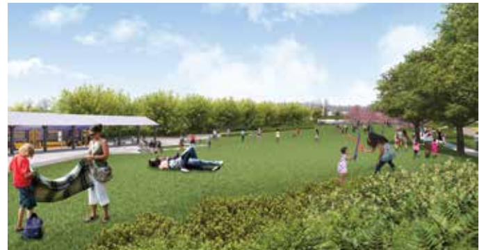
Top: Photo of recent SR 520 construction in Seattle. Bottom: Conceptual rendering of future Montlake lid.