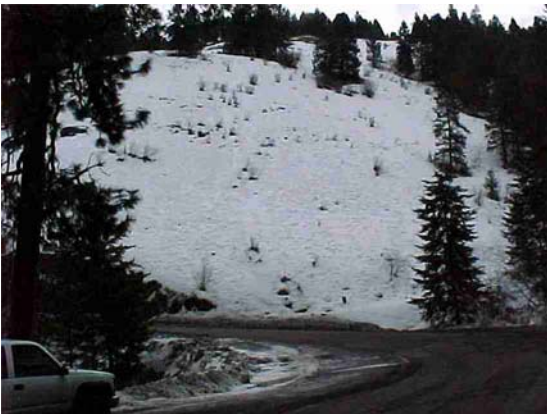
5 Avalanche area MP 11.8