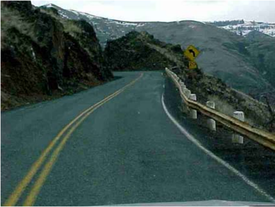
3 Narrow roadway MP 6.88