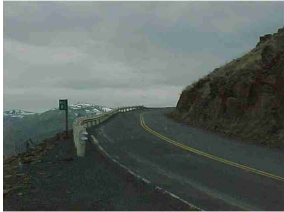
4 Narrow roadway MP 8.0