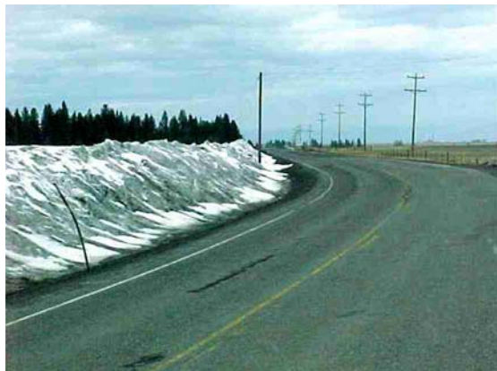
6 Snow drifting area MP 16.0 – 16.3