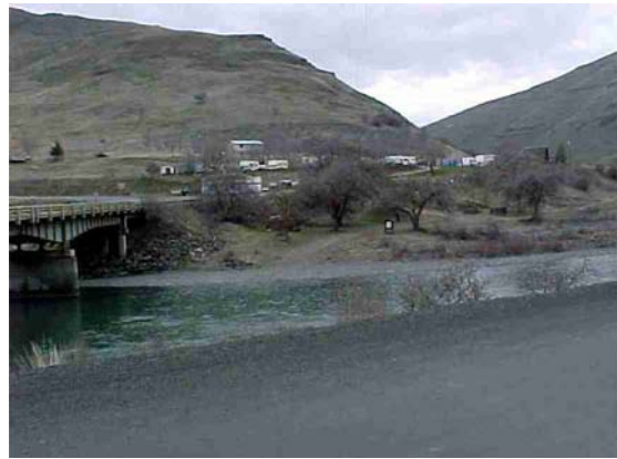
2 Fishing access at Grande Ronde River MP 4.3