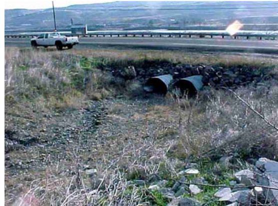
4 Twin pipes at Critchfield Road, settlement hole needs spring cleaning MP 38.6