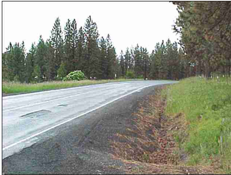
SR 129 at Smyth Road - Open Roadside Character

The roadside character is the user's perspective of the landscape from the pavement edge to the right-of-way boundaries. It describes what you see as you travel along the road. The classification of a facility's roadside character - whether it be Forest, Open, Rural, Semi-urban, or Urban - is defined in the WSDOT Roadside Classification Plan, 1996 .