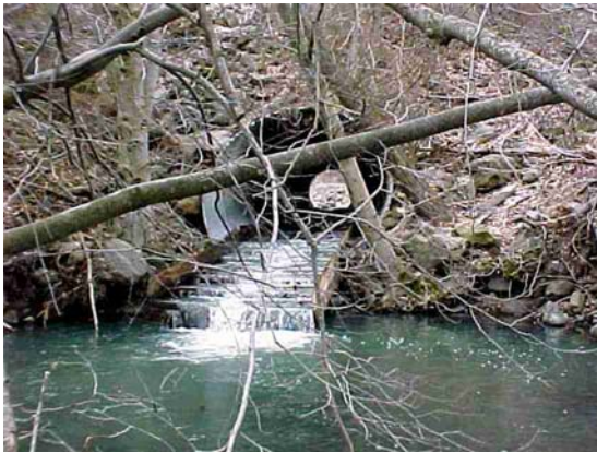
1 Pipe and fish structure at Buford Creek MP 0.9

The following photographs show some of the major environmentally sensitive areas that are typical to this section of SR 129. When route improvements are being scoped or designed, the South Central Region's Environmental Office should be contacted for a more thorough and updated environmental assessment.