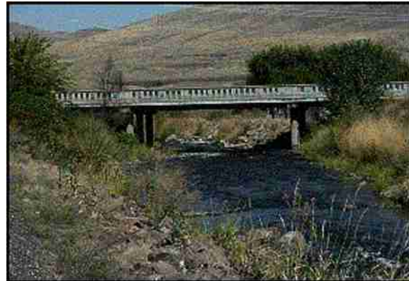
Asotin Creek Bridge