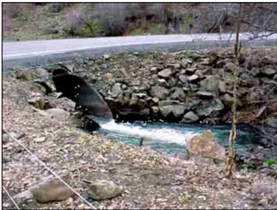
3 Pipe at Rattlesnake Creek crossing MP 5.78