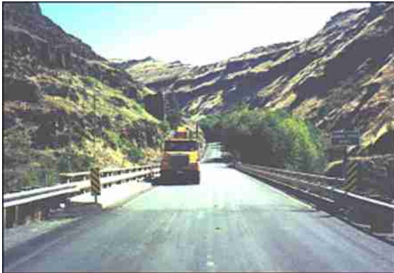
Grande Ronde River Bridge