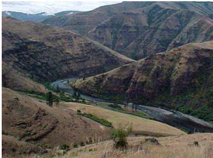
View of Grande Ronde River from SR 129

This corridor of SR 129 has been designated by WSDOT as one of Washington State's Scenic and Recreational Highways 11 .