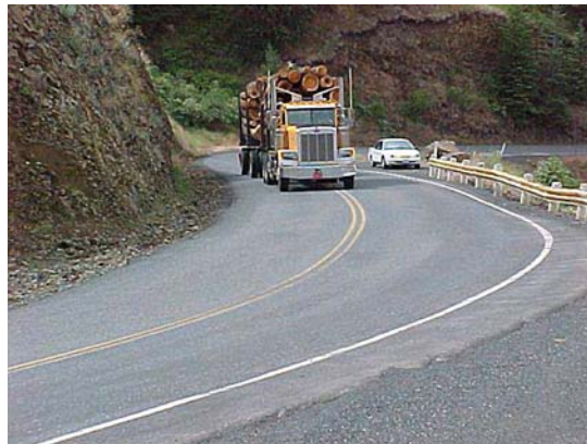
SR 129 at Rattlesnake Creek Grade

The character of traffic in the study area is mainly interregional and recreational travel. This section is a Farm-to-Market road and is used to haul primarily timber, grain, and livestock products. Logging trucks travel the length of the route year round. Grain is shipped from local farms to the ports during the harvest season.