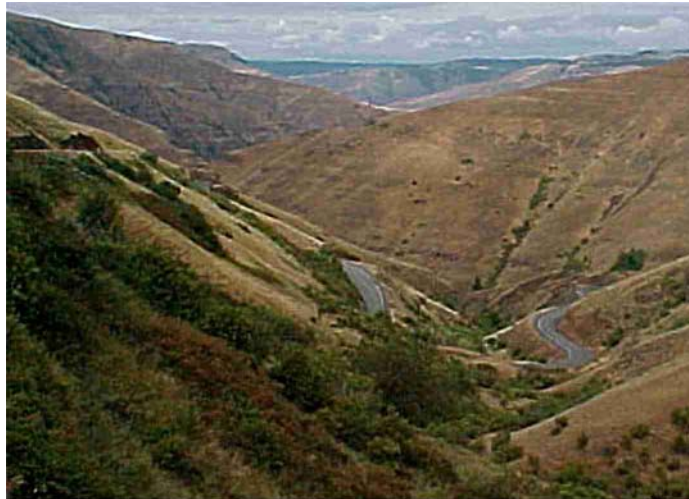
SR 129 overlooking Rattlesnake Creek

This section of SR 129 poses a great challenge to highway designers due to the mountainous terrain limitations, environmentally sensitive areas along Rattlesnake Creek, and potential wetland areas along the Snake River border. Due to the numerous geometric and environmental constraints associated with this section of SR 129, the South Central Region is recommending that any improvement work done on this section of SR 129 be designed to Modified Design Level standards with lanes a minimum of eleven feet wide and paved shoulders a minimum of three feet wide.