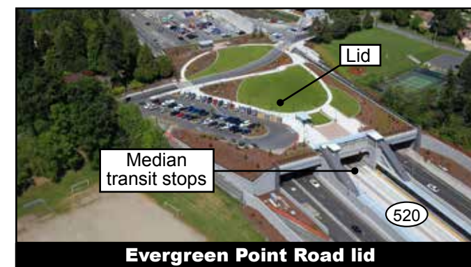
Evergreen Point Road lid

Together, these agencies designed and built a grade-separated overcrossing that allows pedestrians and bicyclists to travel through the Montlake Multimodal Center without having to cross busy streets or wait at crosswalks.