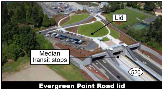
Evergreen Point Road lid

Together, these agencies designed and built a grade-separated overcrossing that allows pedestrians and bicyclists to travel through the Montlake Multimodal Center without having to cross busy streets or wait at crosswalks.