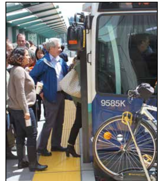
Commuters began using the new median transit stop on SR 520 at Evergreen Point Road in mid-2014.