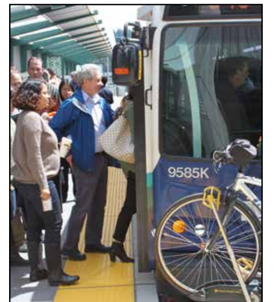
Commuters began using the new median transit stop on SR 520 at Evergreen Point Road in mid-2014.