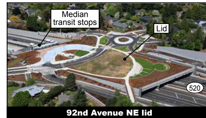
92nd Avenue NE lid