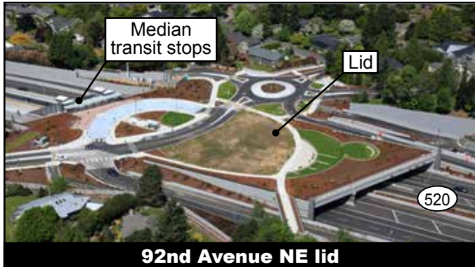
92nd Avenue NE lid