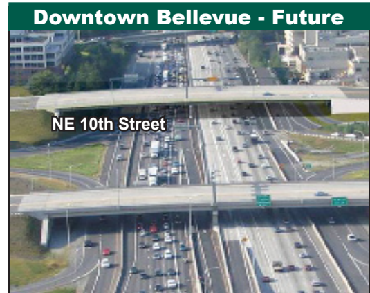
The NE 10th Street bridge crossing, along with other downtown Bellevue projects, will provide improved access in the north end of downtown Bellevue, and will relieve congestion at critical I-405 interchanges.

Doug Haight, WSDOT Project Engineer, 425-649-4429 Steve Peer, WSDOT Communications, 425-456-8624