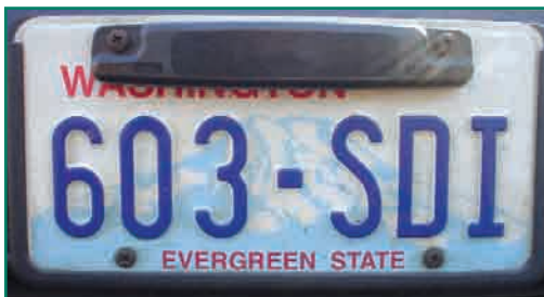
Figure 3: Properly Mounted Transponder.

Contact Customer Service if your vehicle requires an alternate mounting location for the transponder or you have additional questions (866-936-8246).