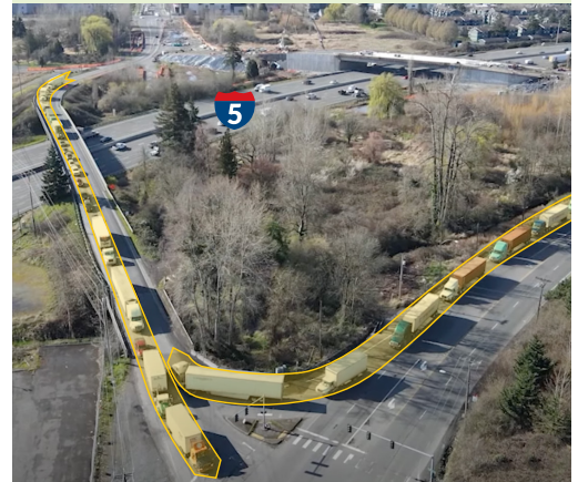
Before the Wapato Way roundabout, trucks would queue in long lines to cross I-5 over the 70th Avenue bridge.

When evaluating whether to install a roundabout, WSDOT collaborates with local agency partners and the community, and conducts thorough traffic analyses.