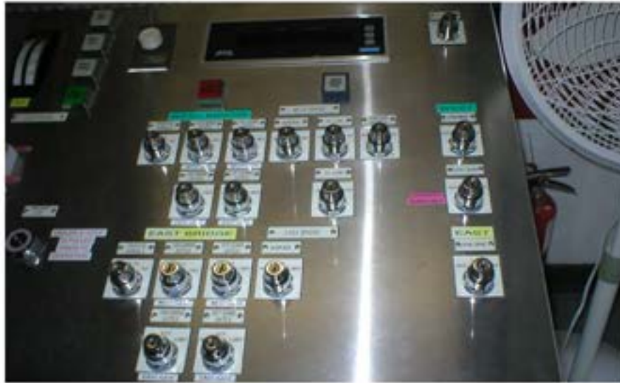
Photo 1 Control Desk