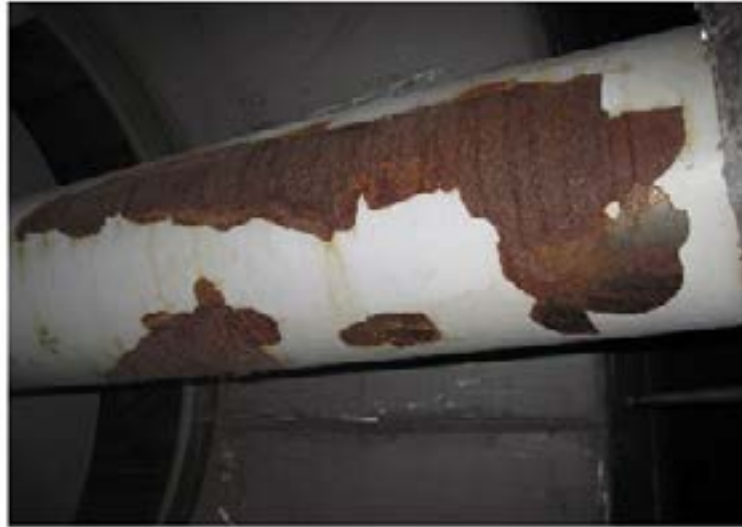
Photo 1 Exhaust Fan Shaft – paint peeling and blistering (typical)